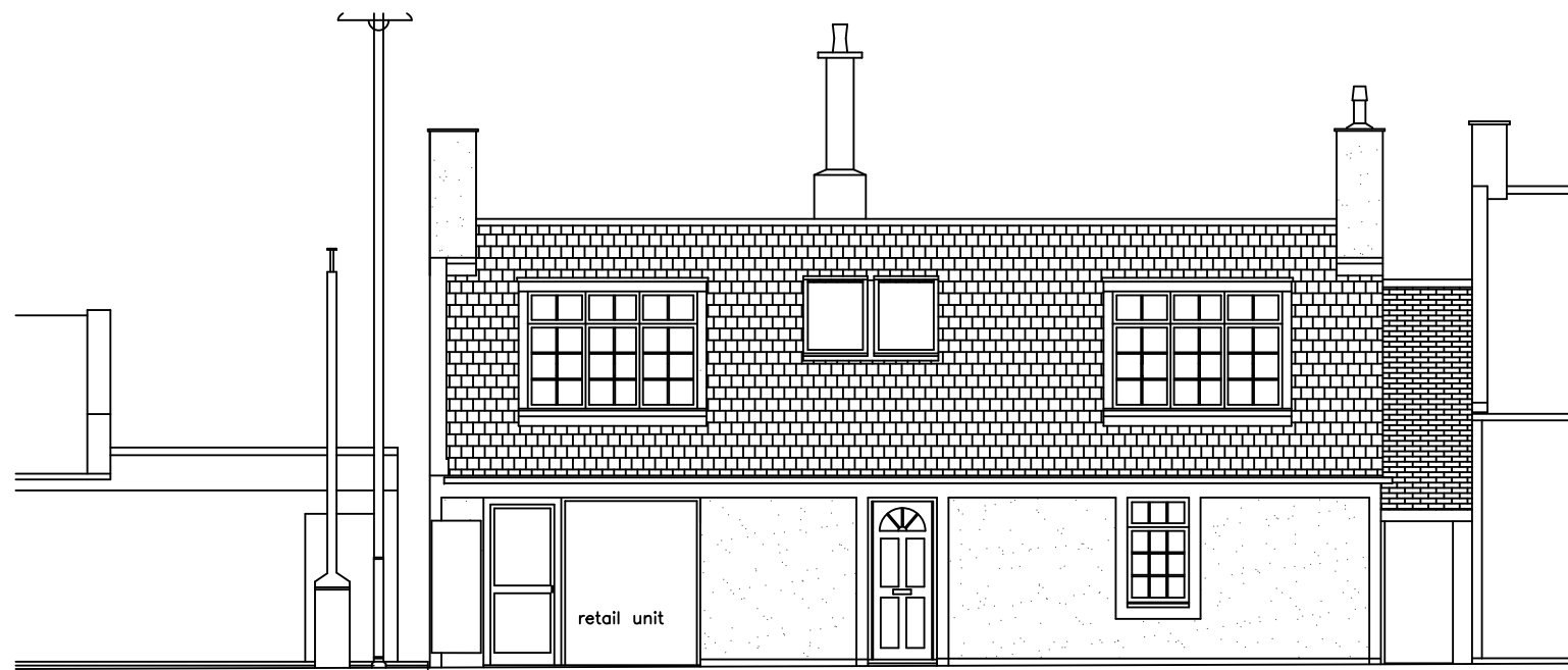
ENTRANCE ELEVATION ( EAST FACING )

FINISHES roofs - slate and felt walls - painted render to front, roughcast to rear doors and windows - timber to front , uPVC to rear shopfront - aluminium timber cladding to rear porch - weathered grey finish