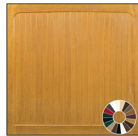
COMPOSITE GARAGE DOOR - EBONY (BLACK)