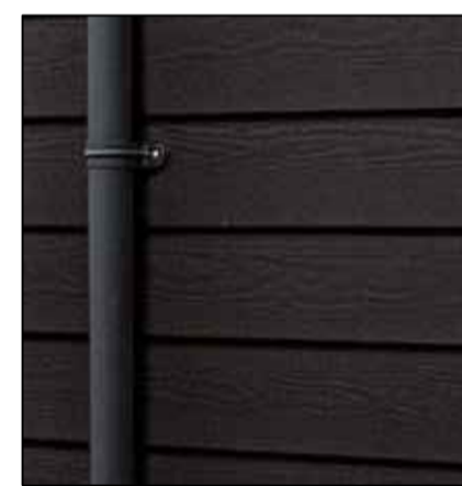
WEATHERBOARD - BLACK FIBRE CEMENT