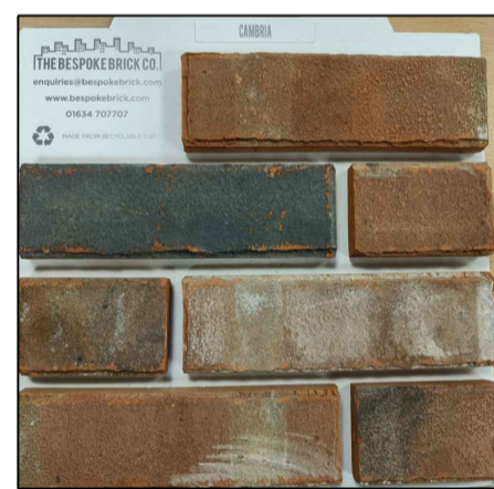
FACING BRICKS - CAMBRIA RED