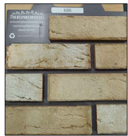
DETAIL QUOIN BRICKS - ALASKA