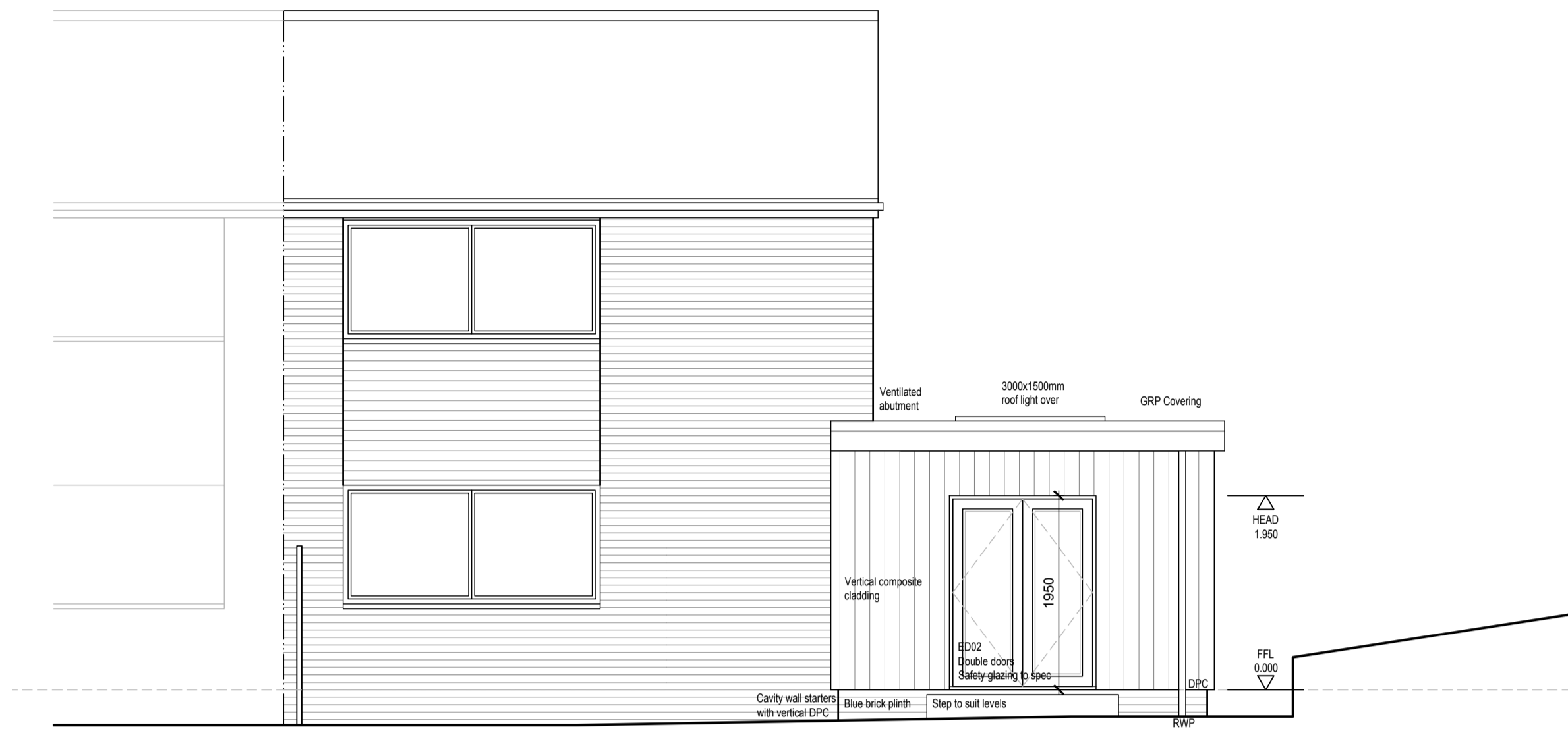
Proposed South East Elevation Scale 1:50