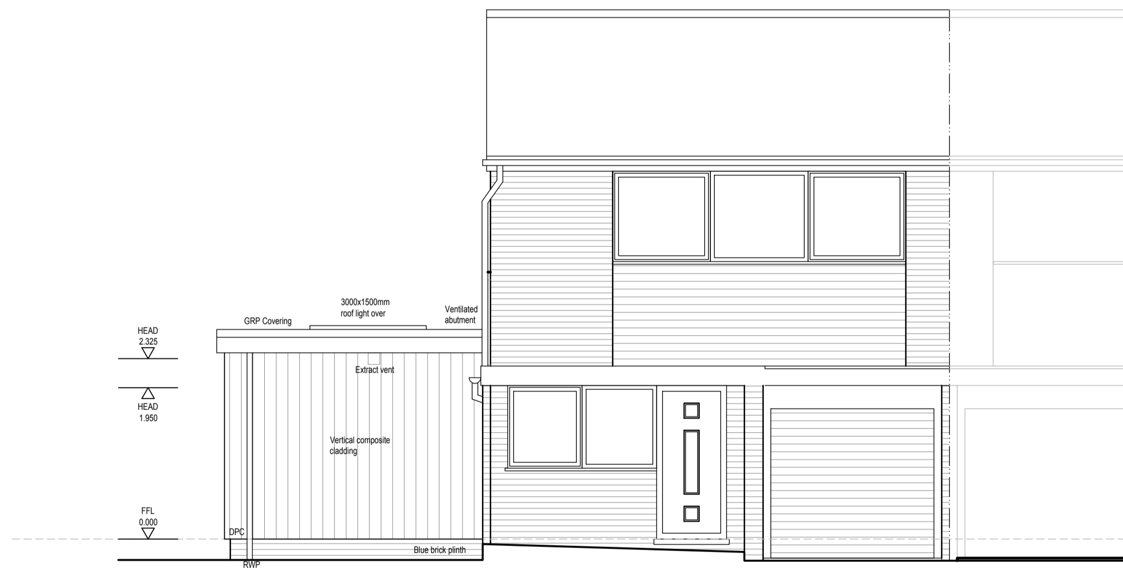
Proposed North West Elevation Scale 1:50