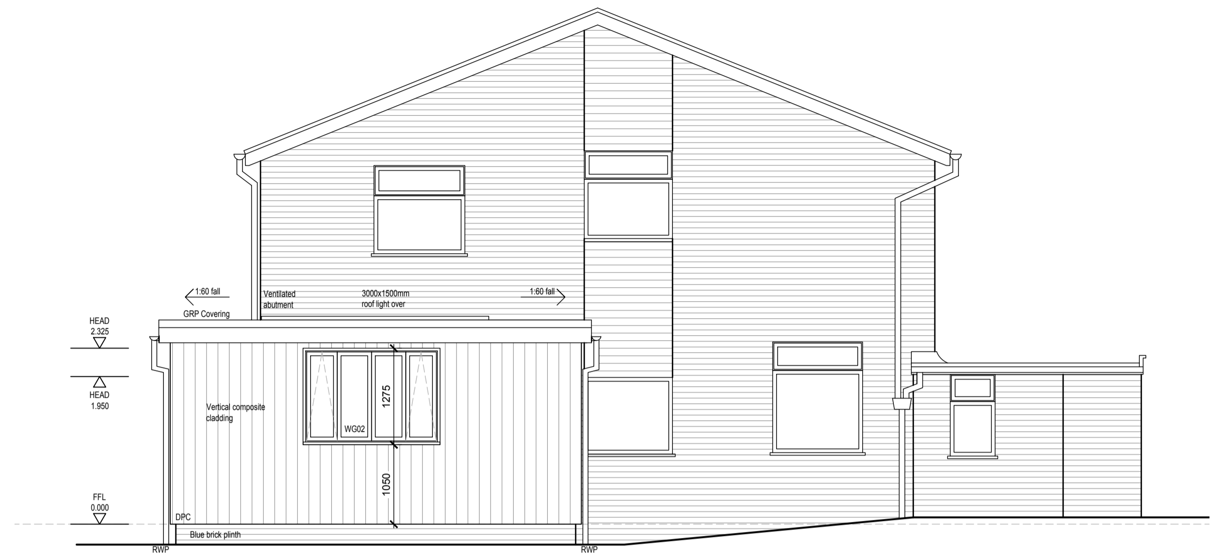
Proposed North East Elevation Scale 1:50