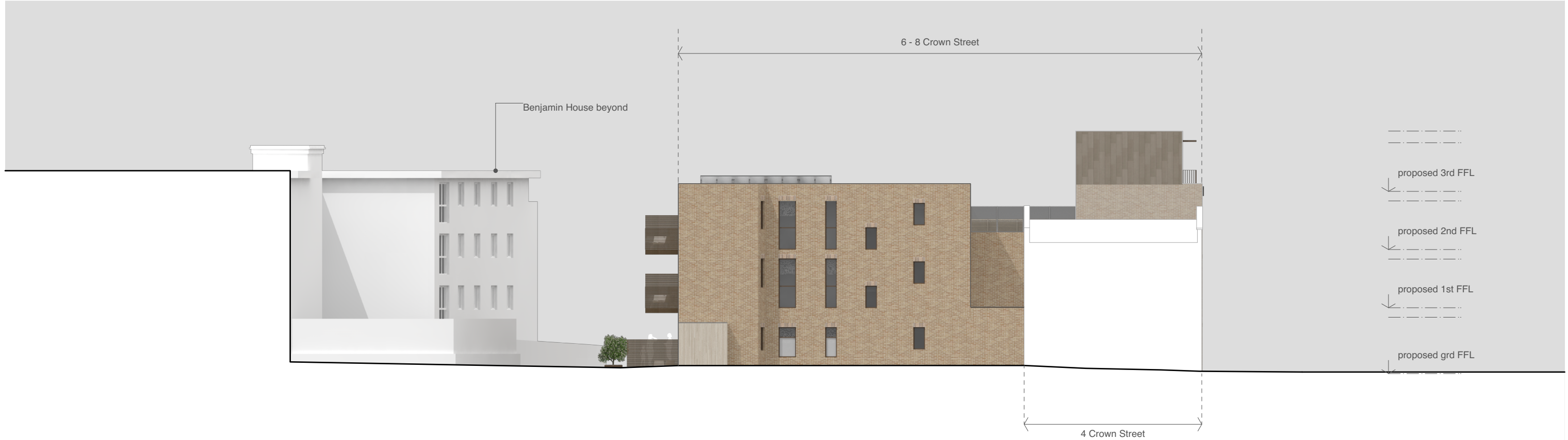
002 | proposed side / ne context elevation