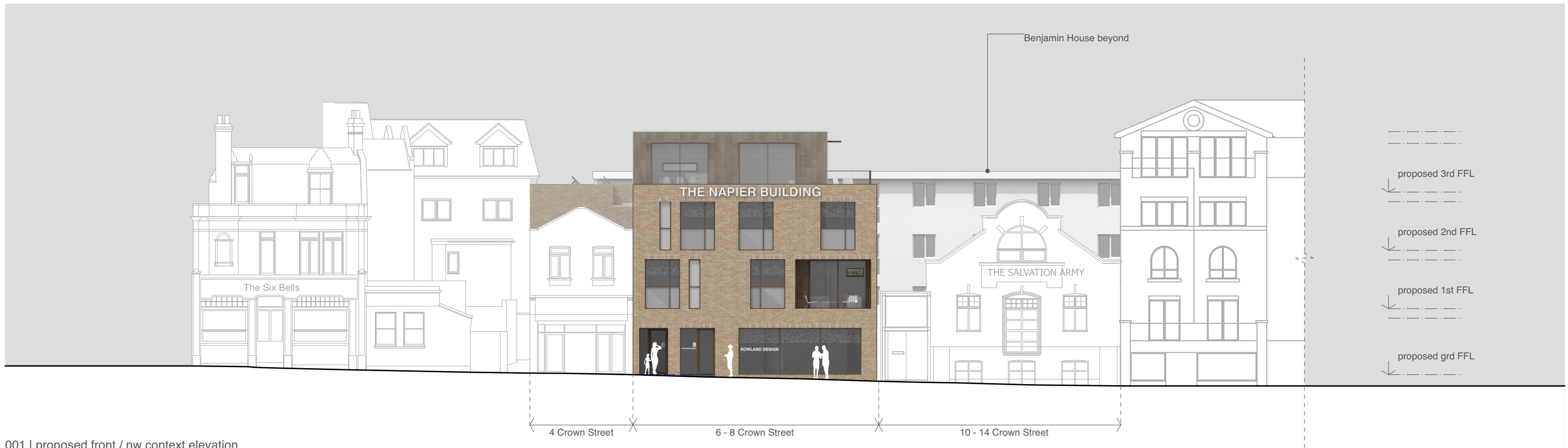
001 | proposed front / nw context elevation