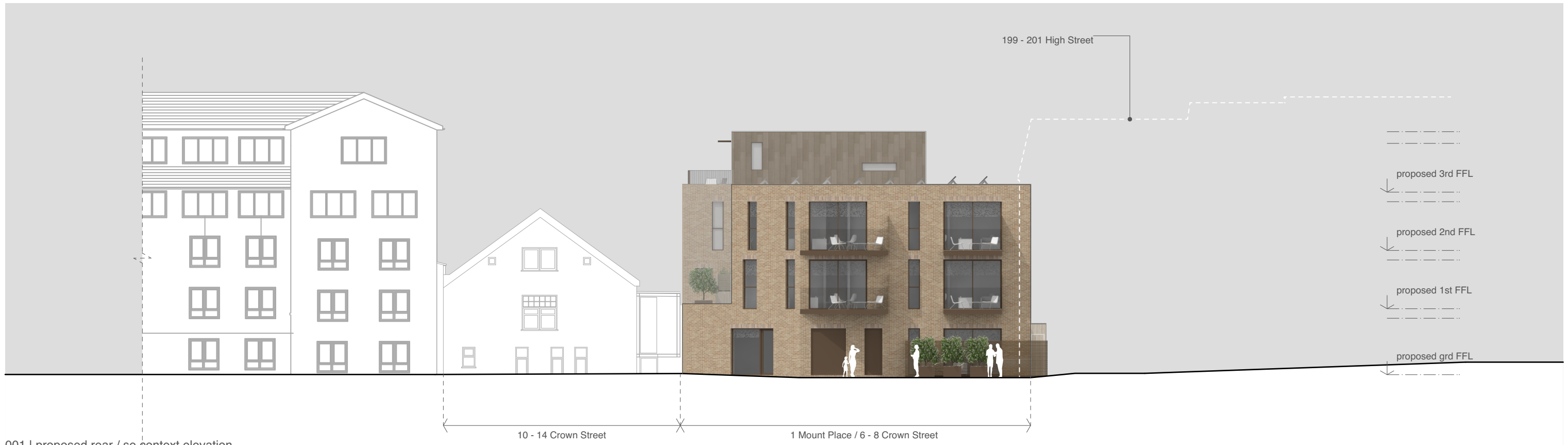
001 | proposed rear / se context elevation