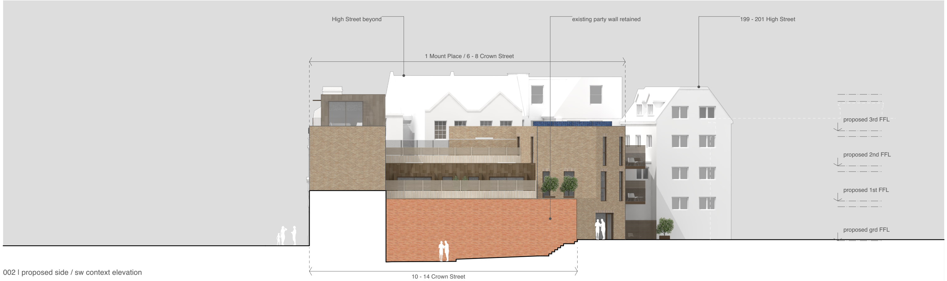
002 | proposed side / sw context elevation