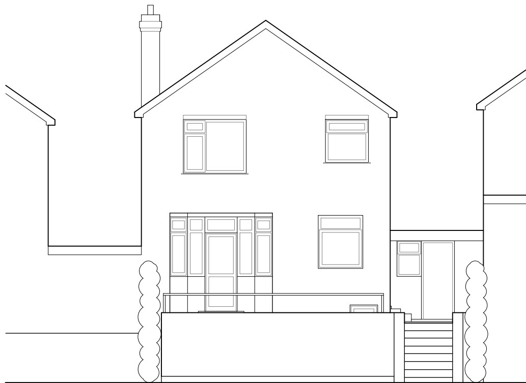
Rear elevation with raised patio