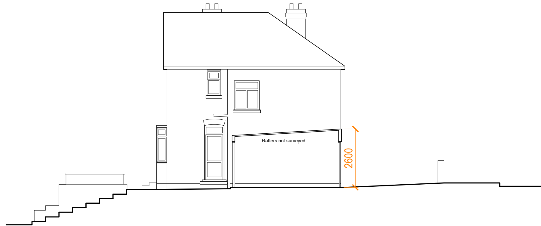
Side (East) elevation