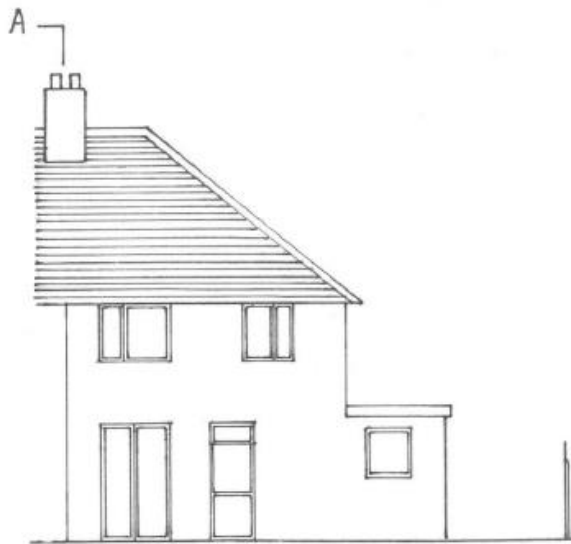
Existing North Elevation @ 1:100