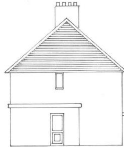
Existing West Elevation @ 1:100