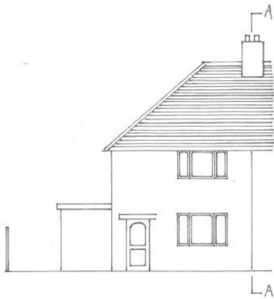
Existing South Elevation @ 1:100