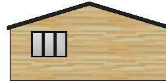
Proposed north elevation