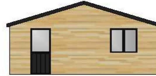
Proposed south elevation