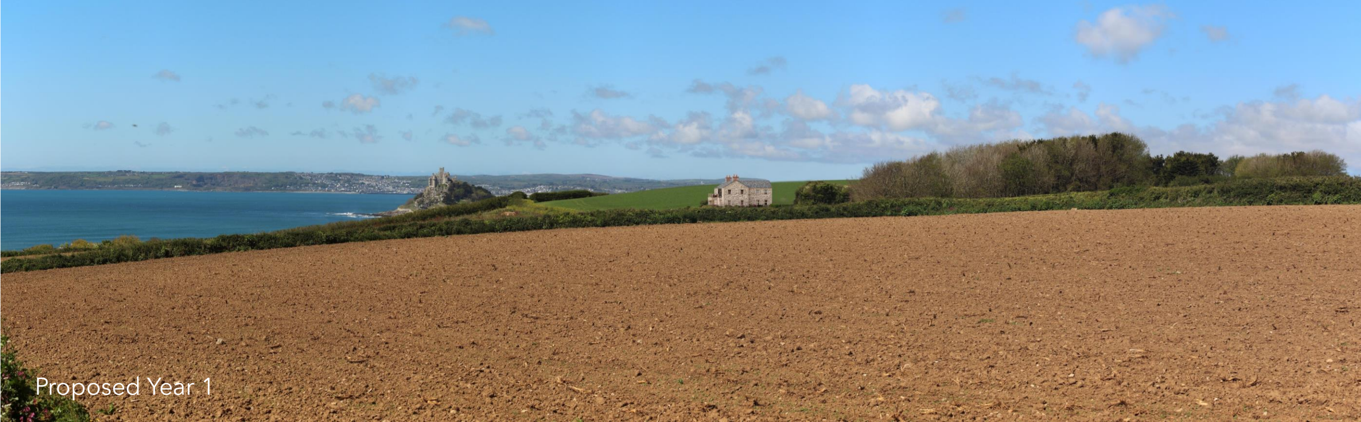
Proposed Year 1