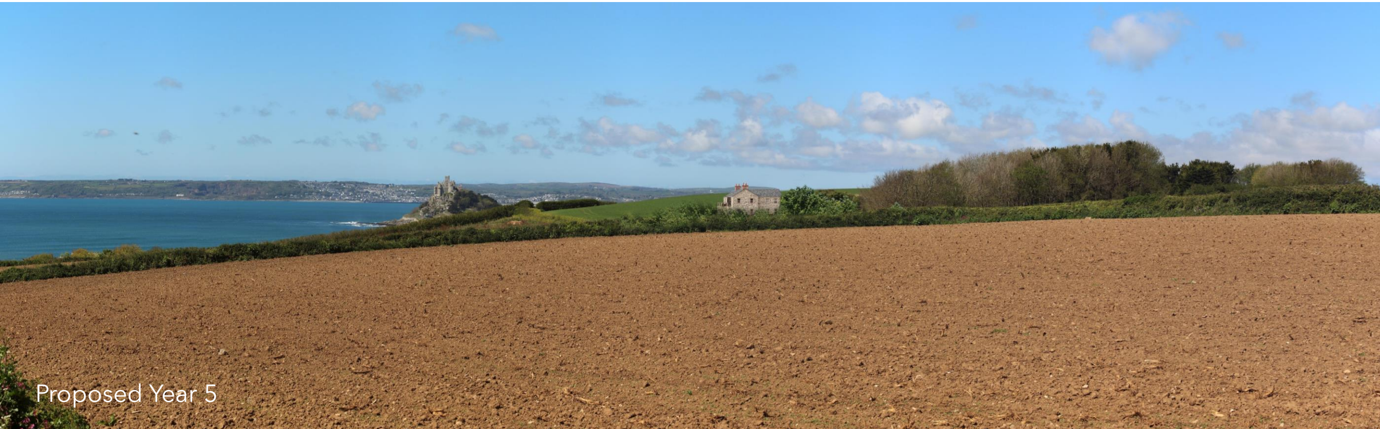
Proposed Year 5