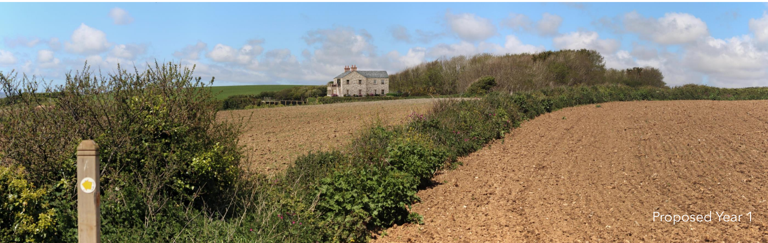
Proposed Year 1