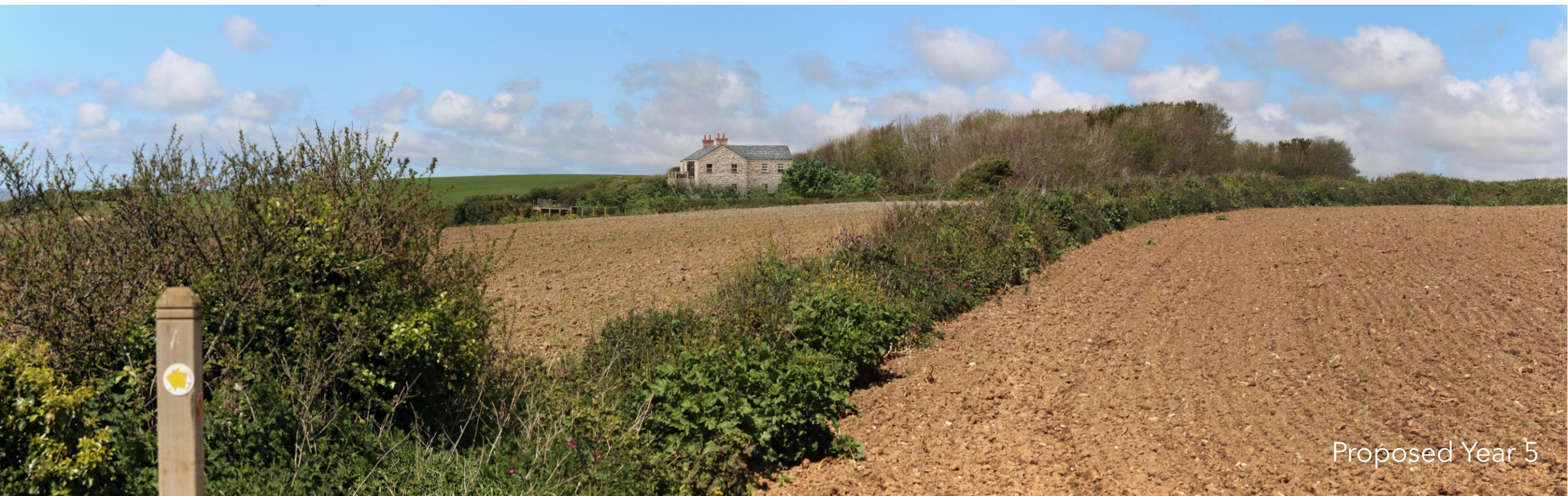
Proposed Year 5