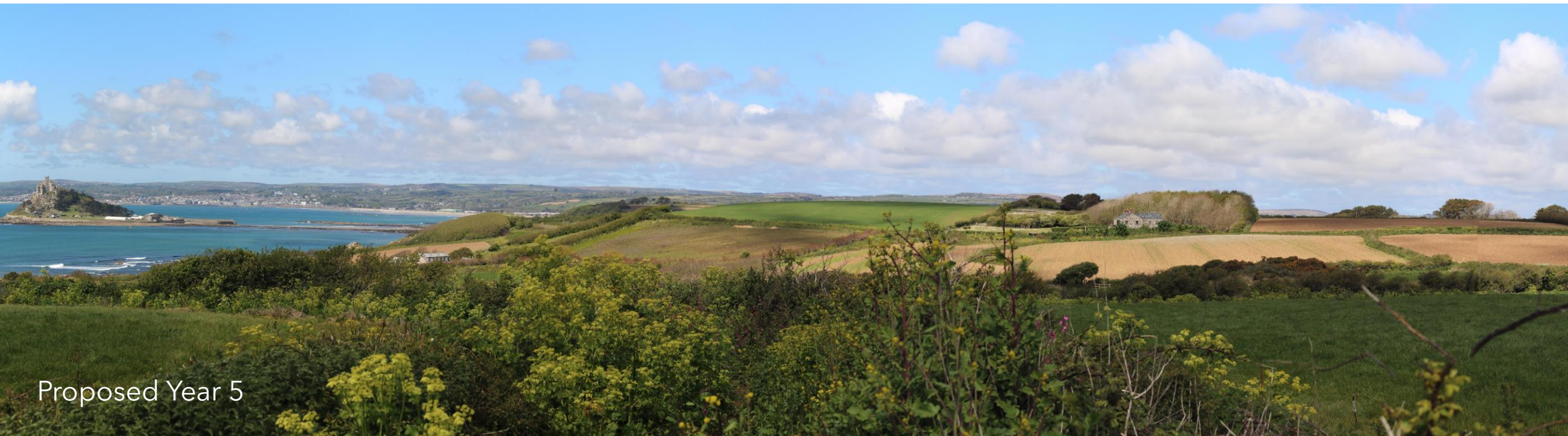
Proposed Year 5