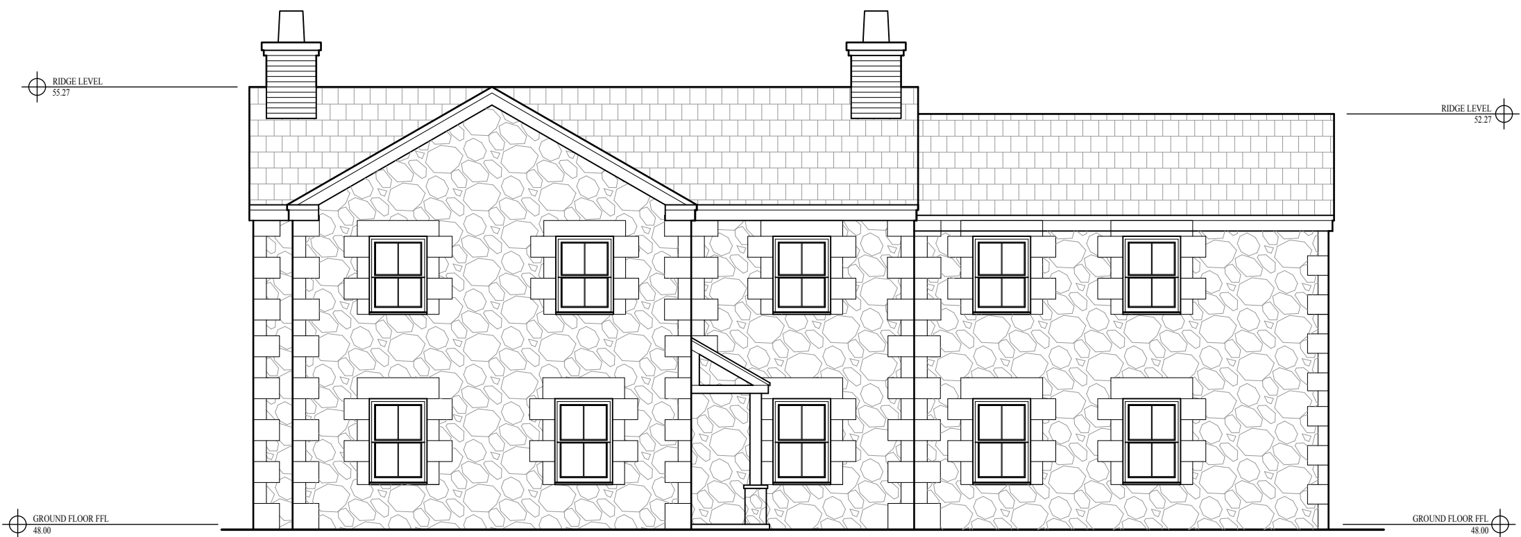
1 NORTHEAST ELEVATION 104