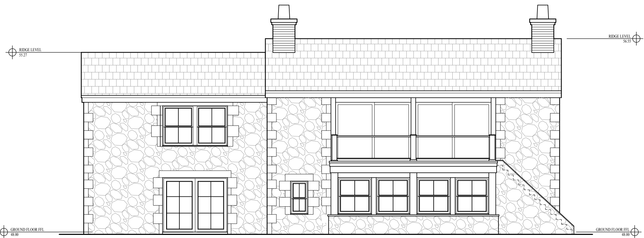
2 SOUTHWEST ELEVATION 104