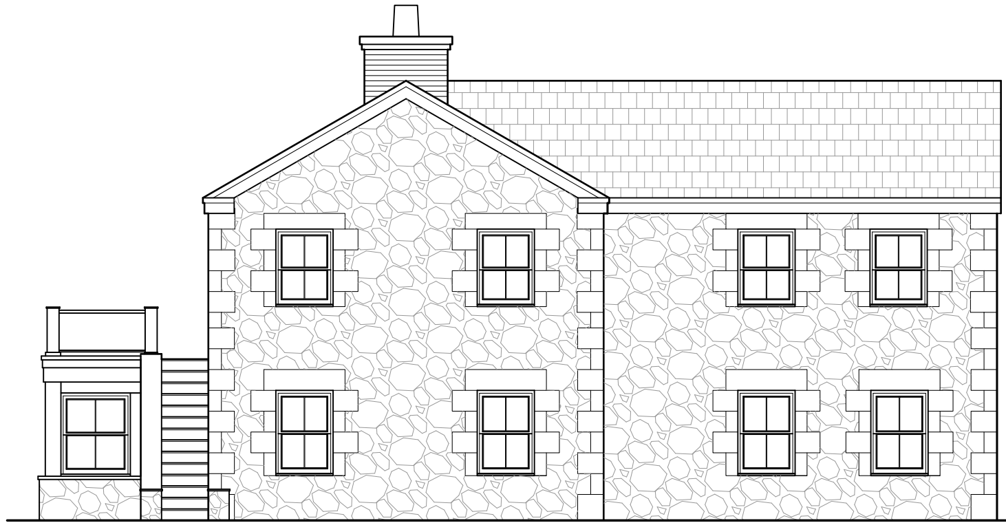
2 SOUTHEAST ELEVATION 105