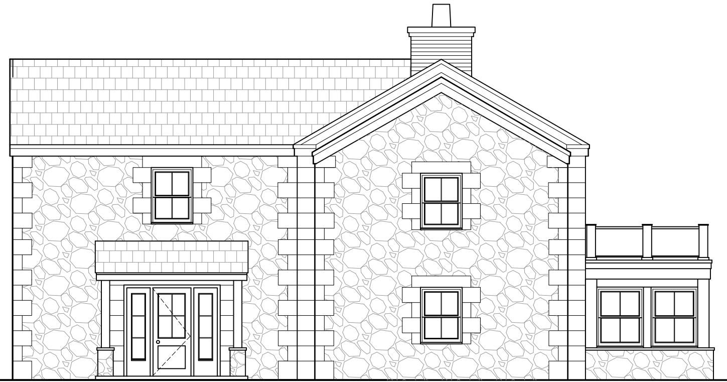
1 NORTHWEST ELEVATION 105