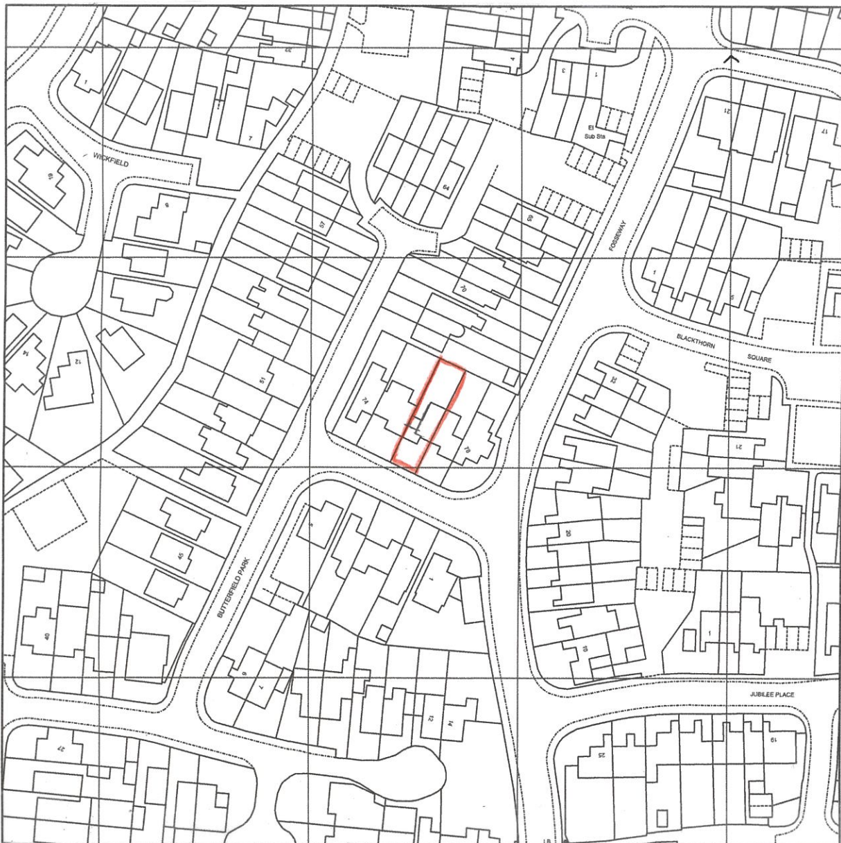
EXISTING LOCATION PLAN