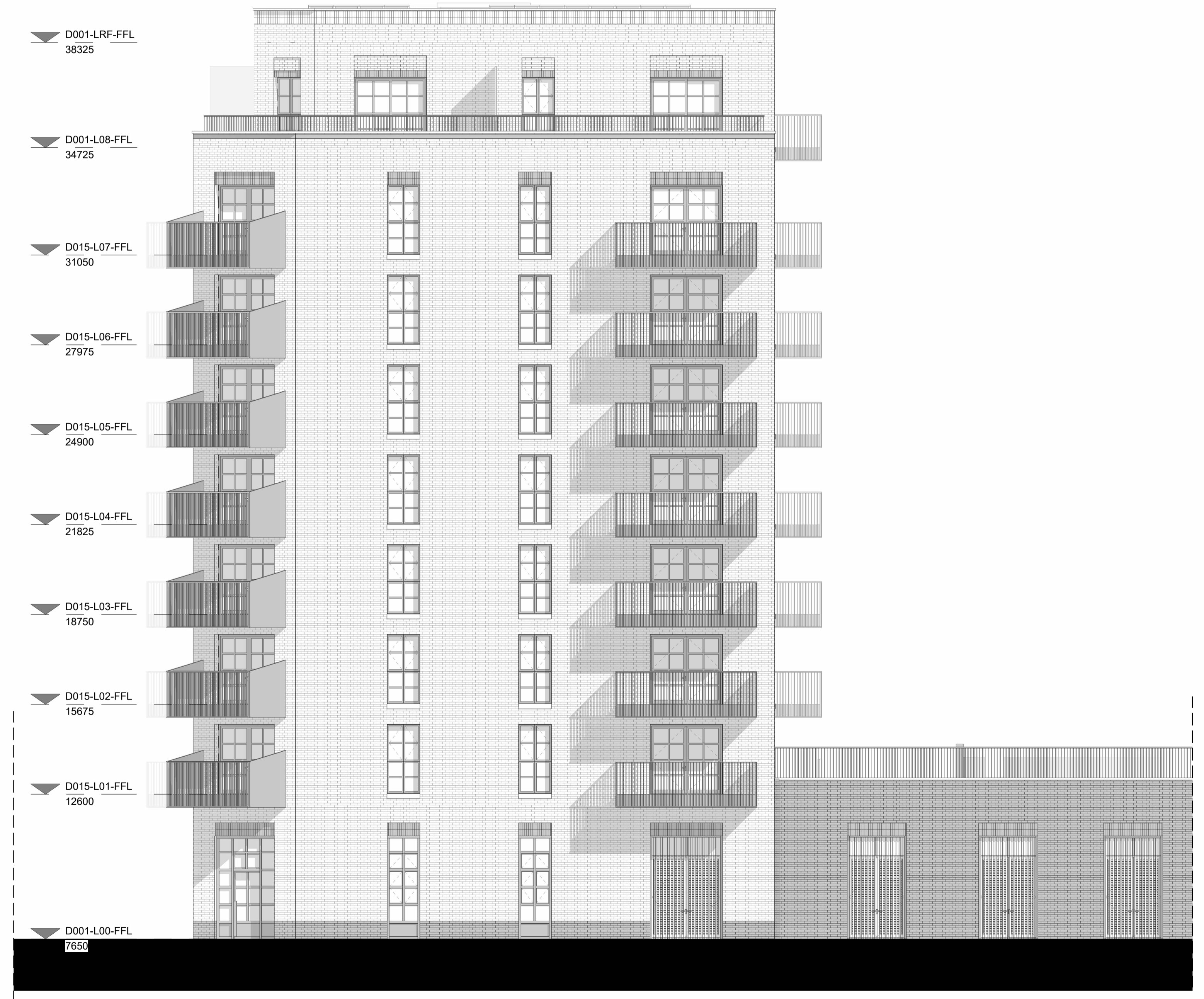
Proposed D1 North East Elevation 1 : 100