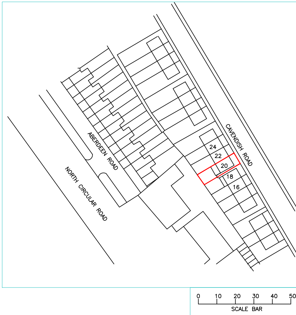
OS MAP 1:1250