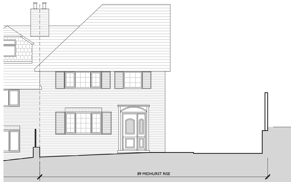
+EL Proposed East elevation - scale 1:100 at A3 Scale in Metres 0 1 2 3 4 5