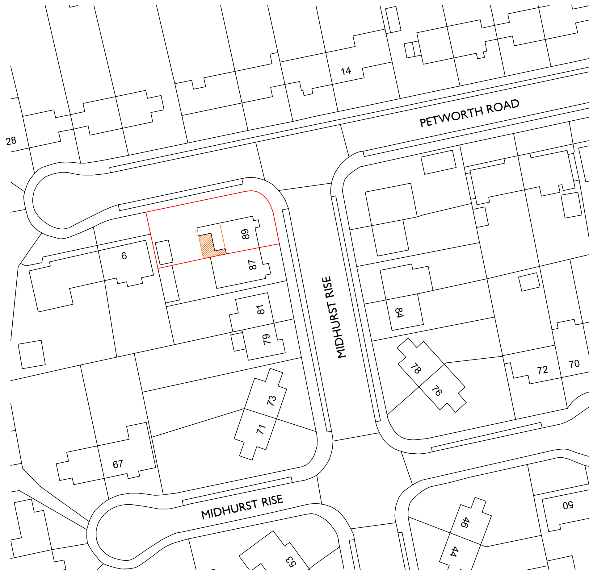
+BP Proposed Block plan - scale 1:500 at A3