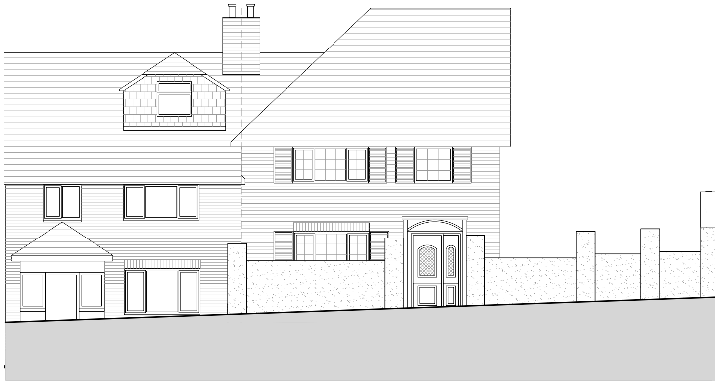
+EL Proposed Contextual East Elevation - scale 1:100 at A3 Scale in Metres