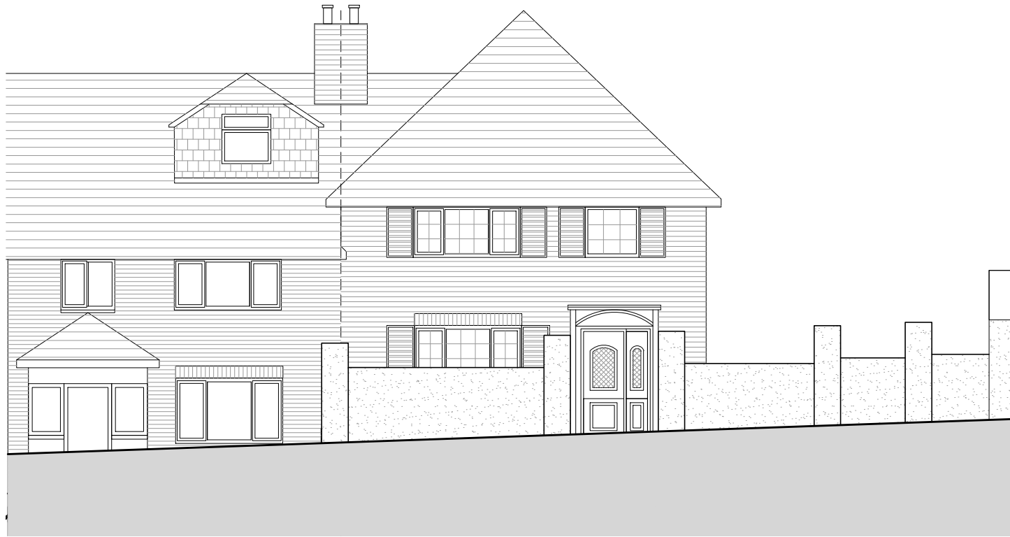
+EL Existing Contextual East Elevation - scale 1:100 at A3 Scale in Metres