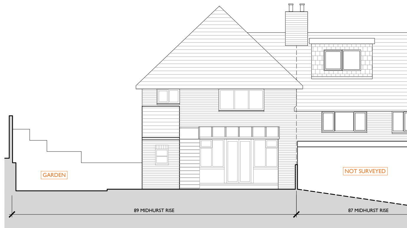
+EL Existing West elevation - scale 1:100 at A3 Scale in Metres 0 1 2 3 4 5