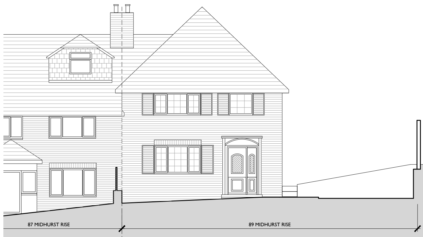
+EL Existing East elevation - scale 1:100 at A3 Scale in Metres 0 1 2 3 4 5