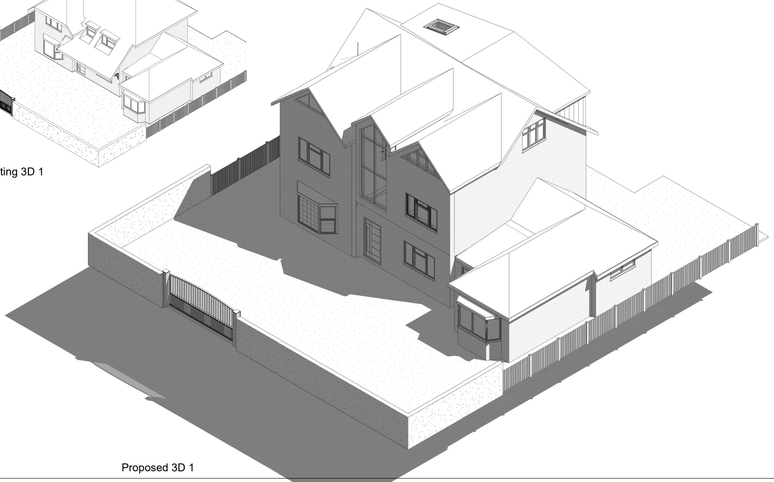
Proposed 3D 1