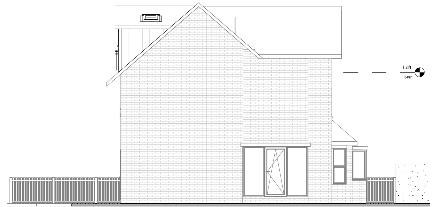
Proposed Elevation-Left side