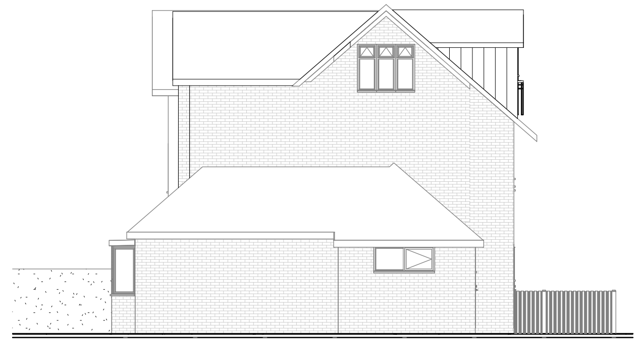
Proposed Elevation-Right side