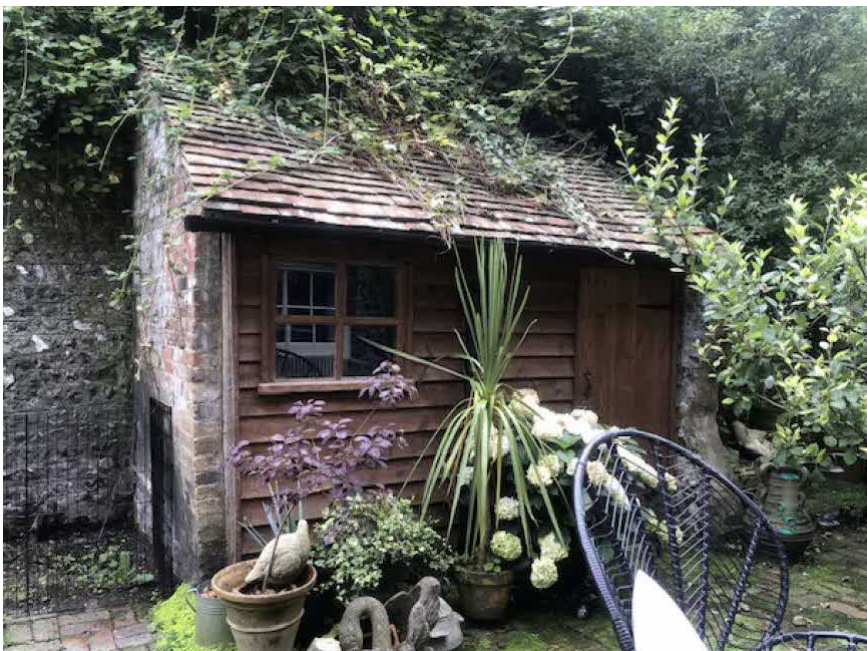
Figure 3 – Existing lean-to