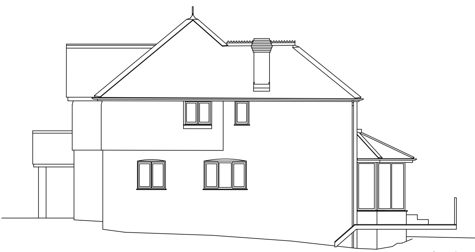
EXISTING WEST ELEVATION (NO CHANGE)