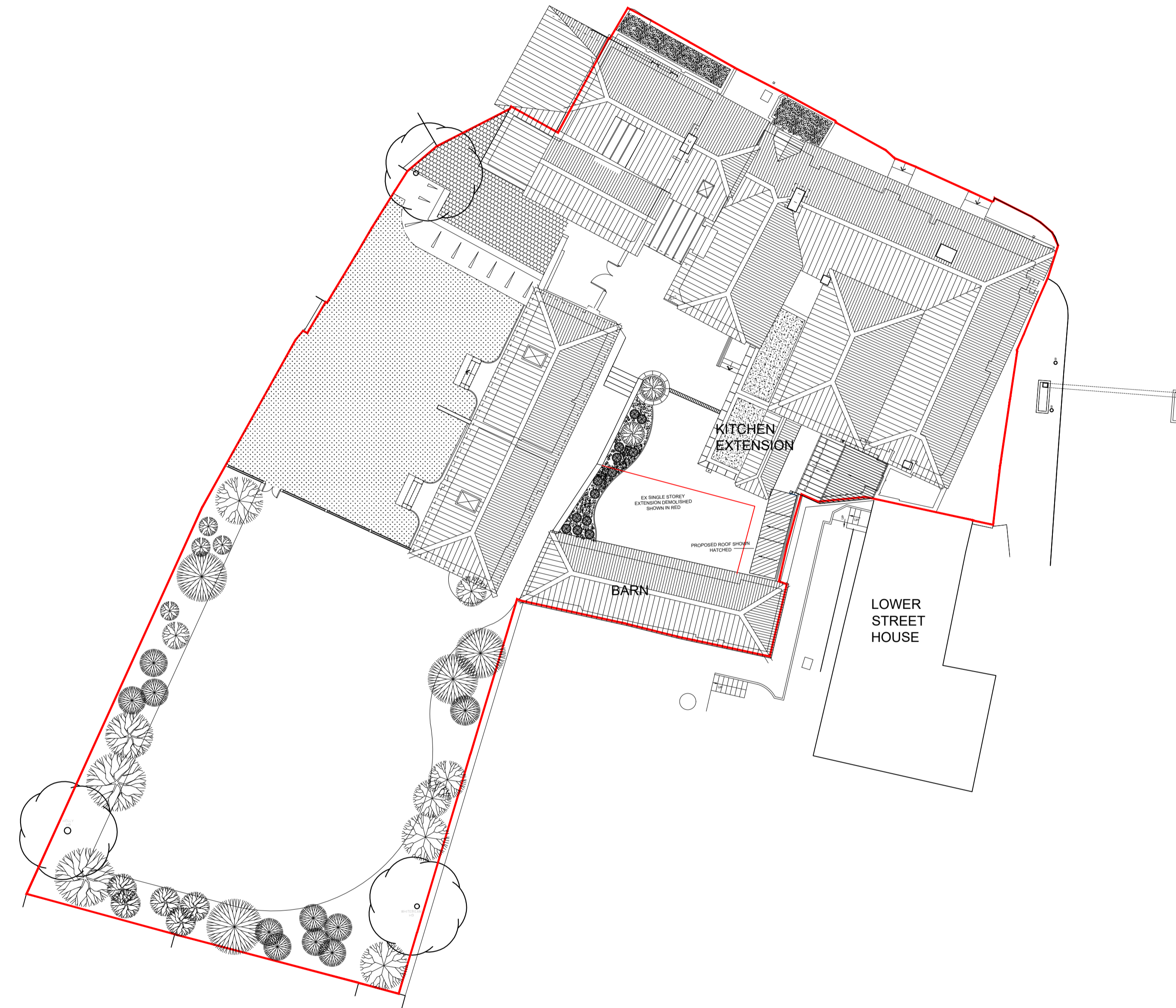
2 PROPOSED SITE PLAN SCALE - 1:1200 @ A1