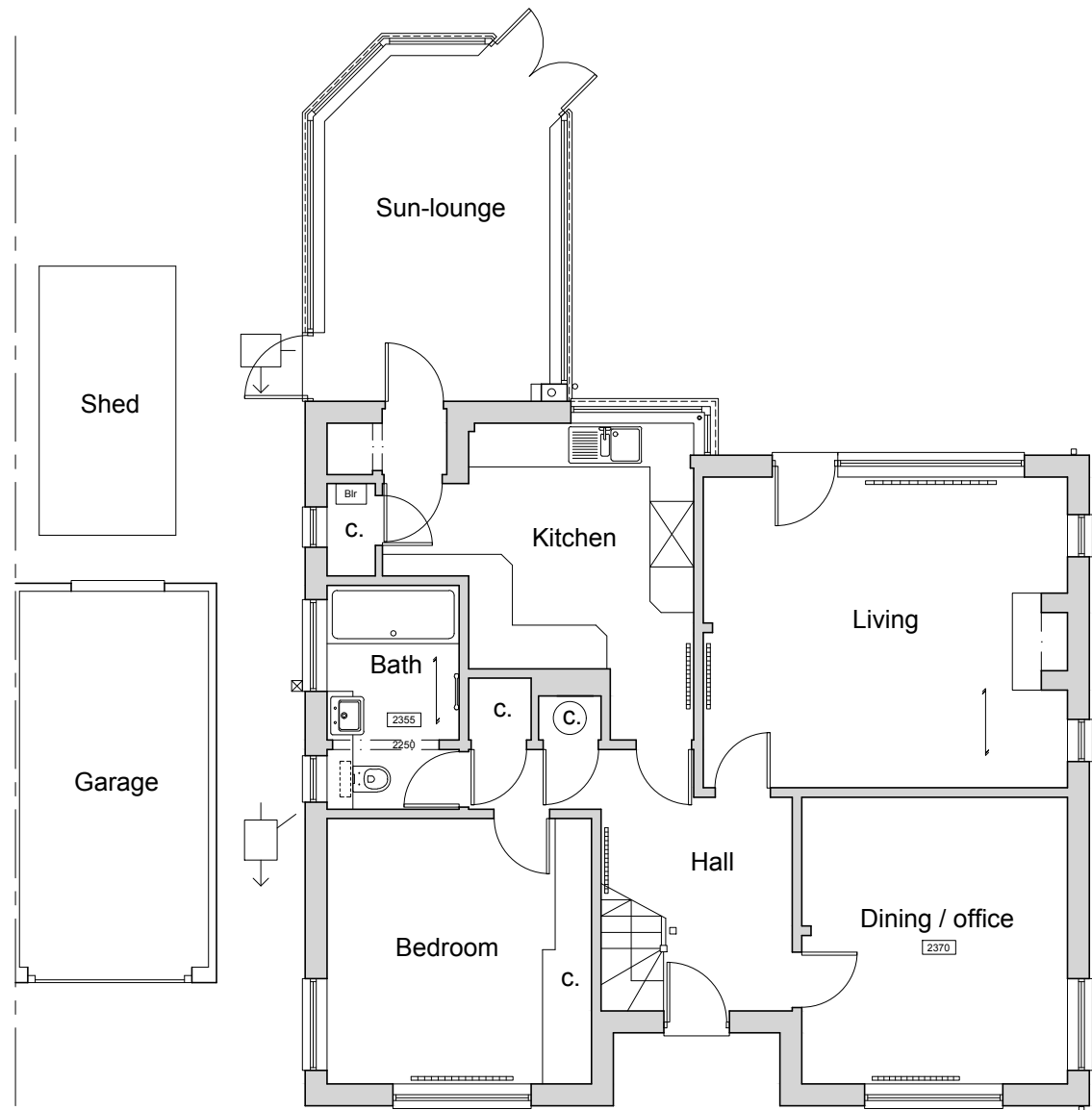
Existing Ground Floor Plan 1:100 @ A3