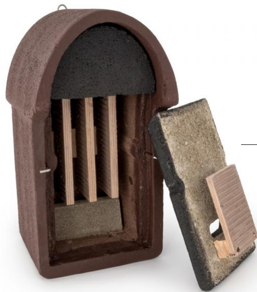
Multi chamber Bat box, to be installed 3 -6m above ground prior to demolition of existing dwelling in accordance with Bat Report ref:7826