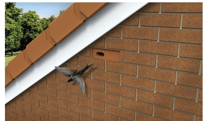
3no. integrated swift boxes at high level under eaves, in accordance with Bat Report ref:7826

© The copyright of this drawing remains with Pro Vision and may not be reproduced in any form without prior written consent. May contain public sector information licensed under the Open Government Licence v3.0.