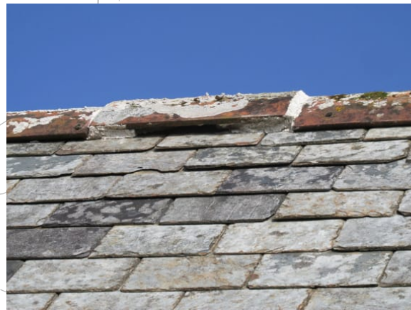
Bat access ridge tile. In accordance with Bat Report ref:7826