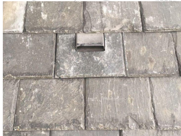
Bat access slate. In accordance with Bat Report ref:7826