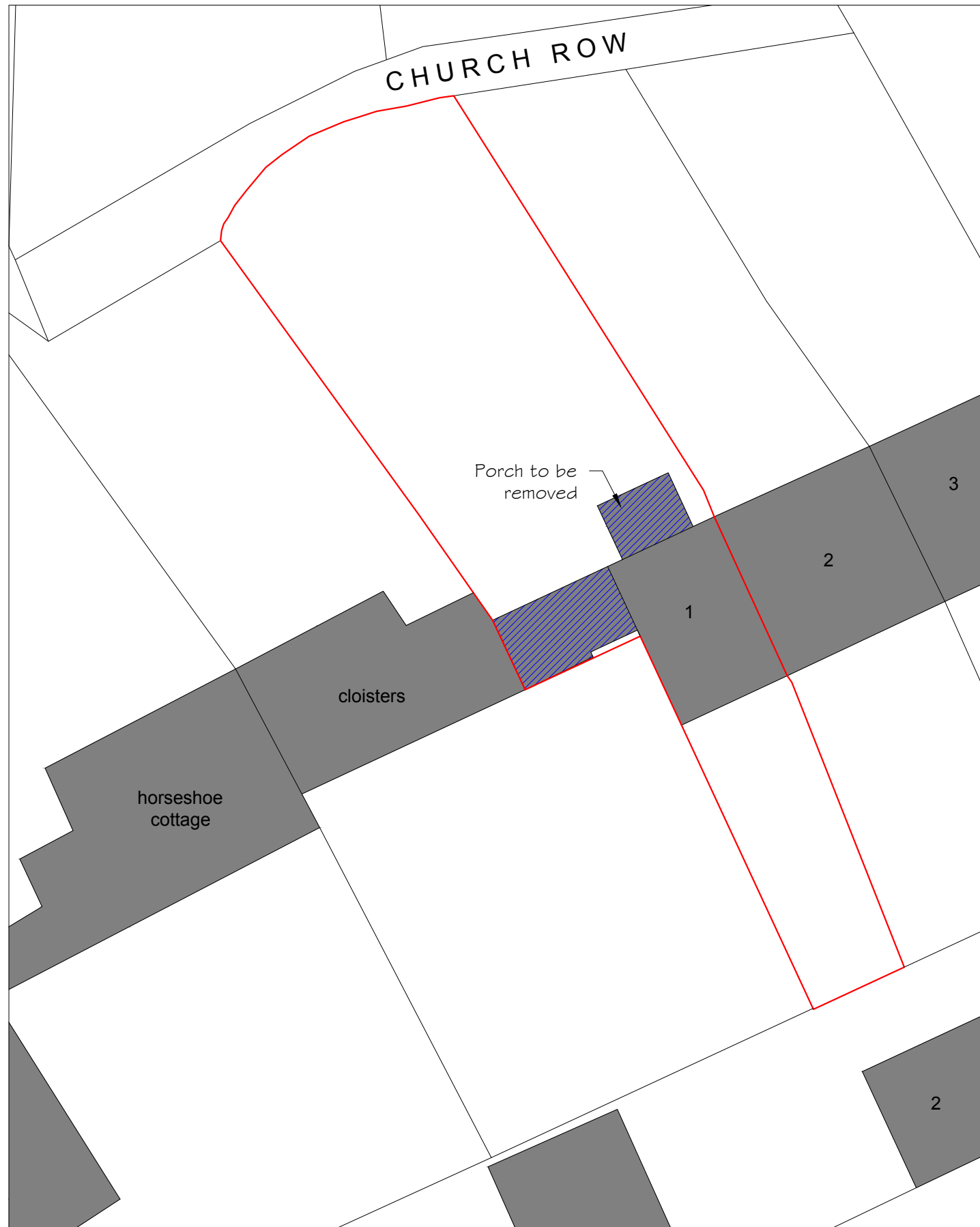
BLOCK PLAN Scale 1:200

THIS DRAWING MUST NOT BE USED FOR CONSTRUCTION PURPOSES