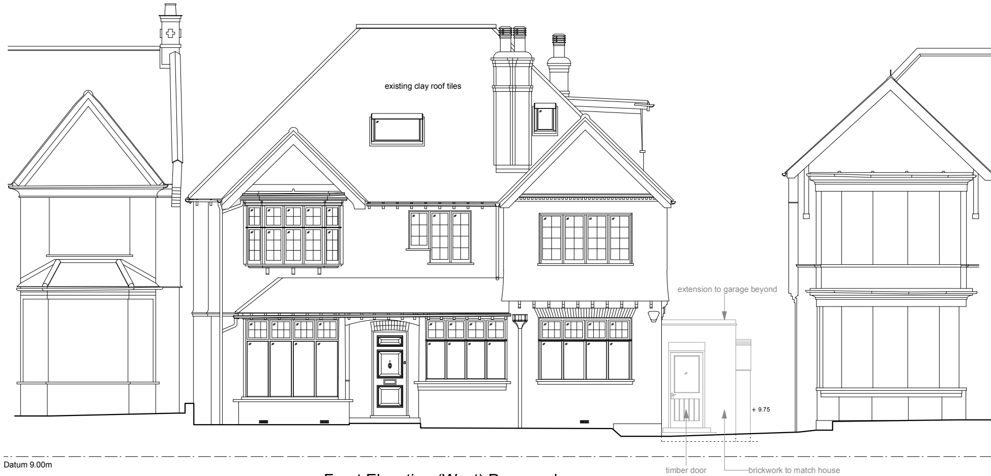
Front Elevation (West) Proposed