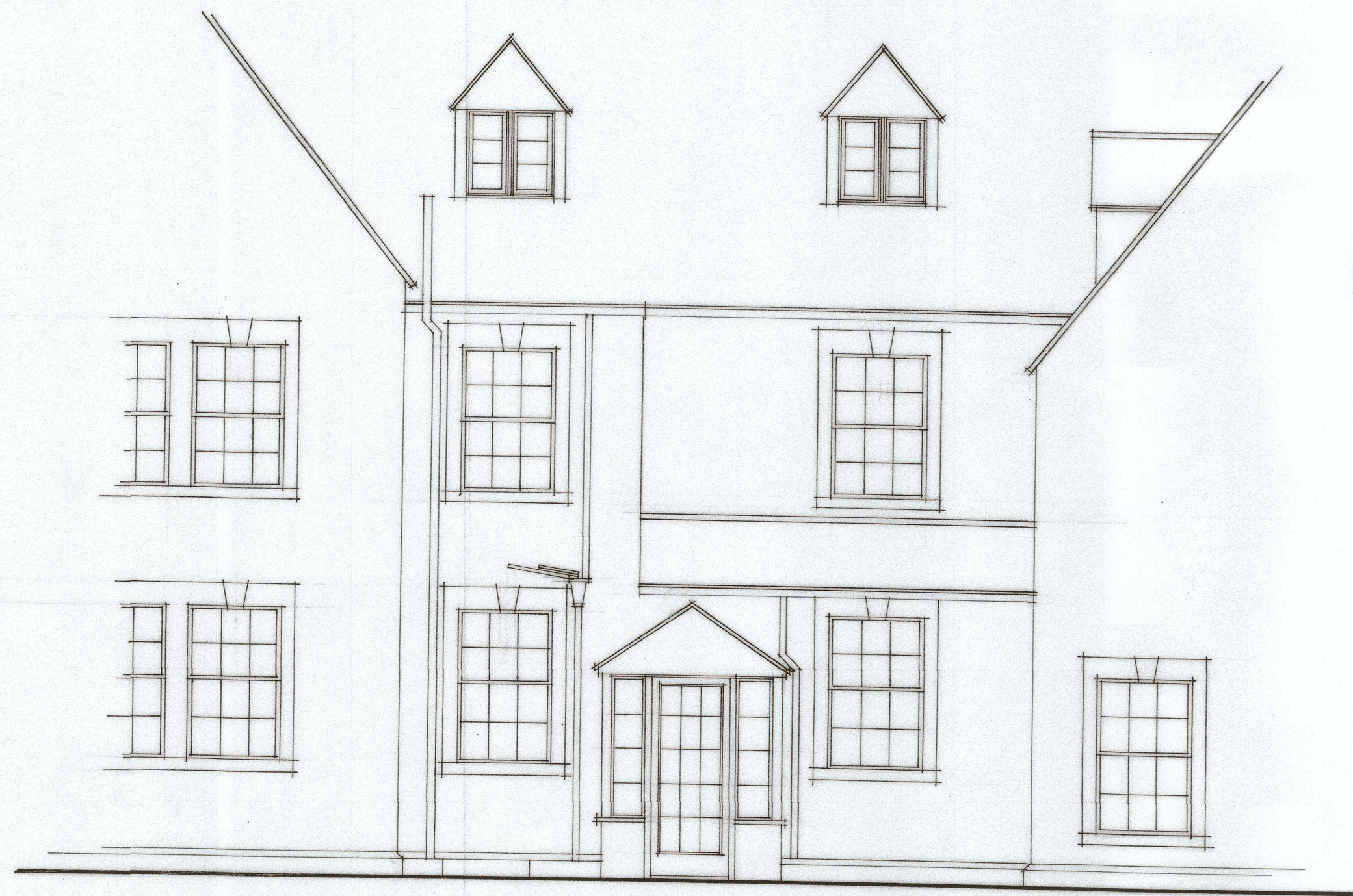
PART REAR ELEVATION