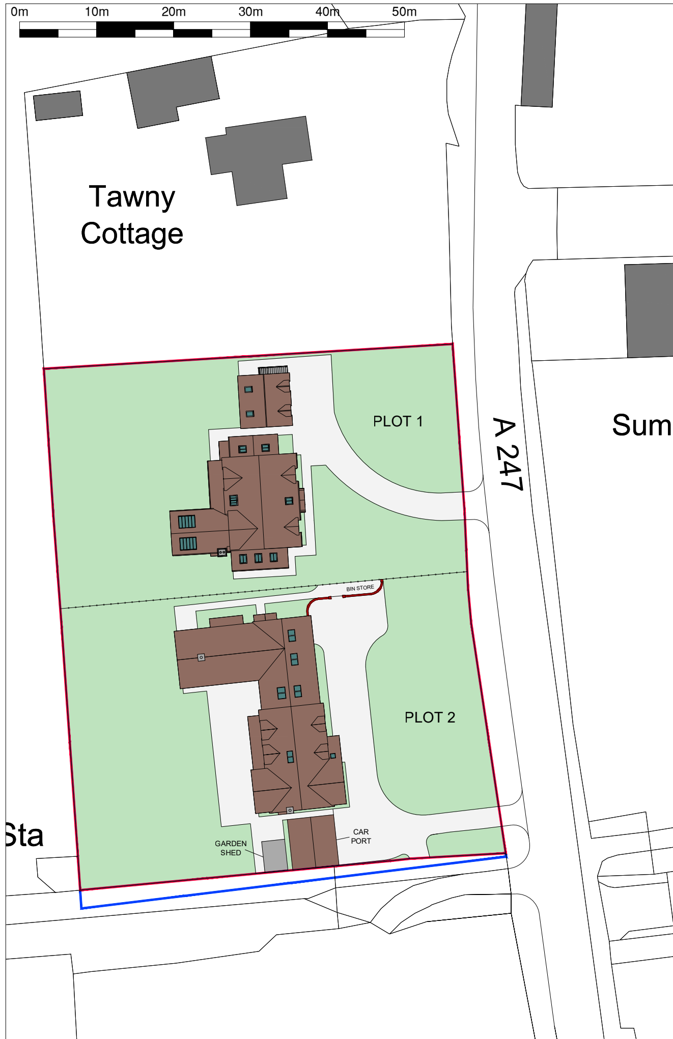
BLOCK PLAN PROPOSED (Scale 1:500)