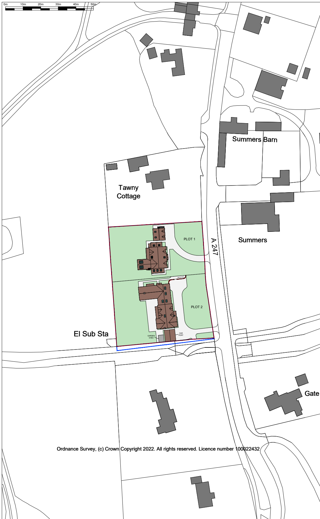
LOCATION PLAN PROPOSED (Scale 1:1250)