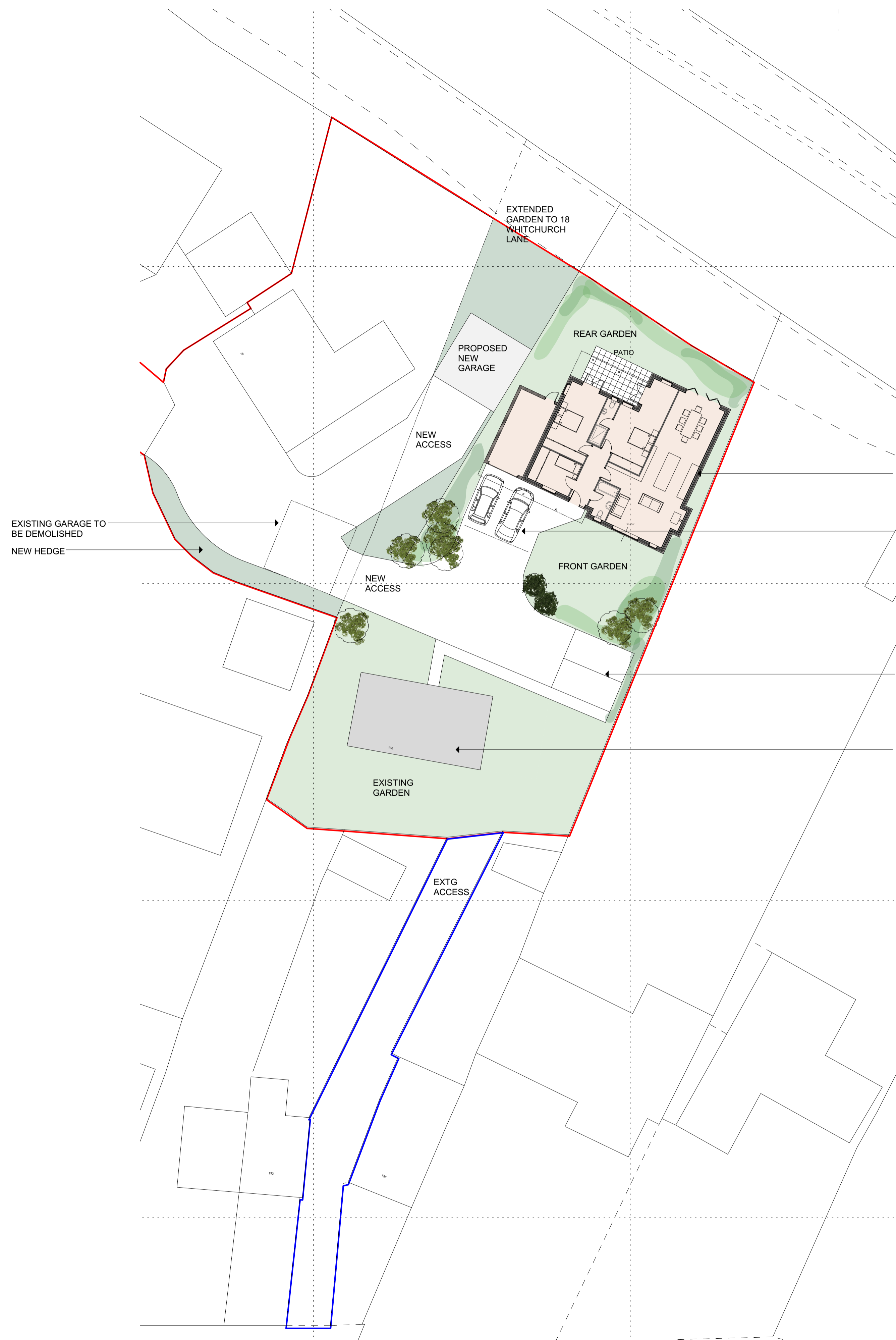
SITE LAYOUT PLAN (1:200)