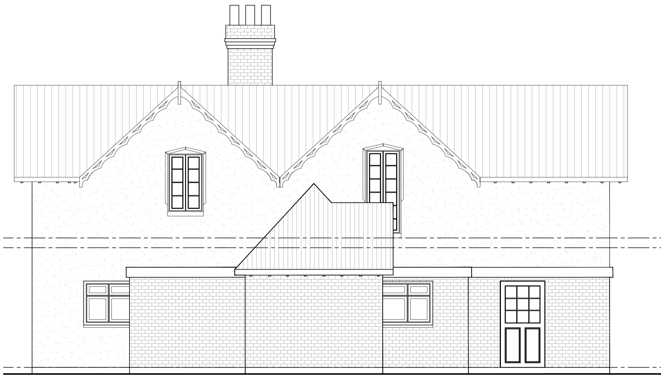
Existing Rear Elevation 1:50