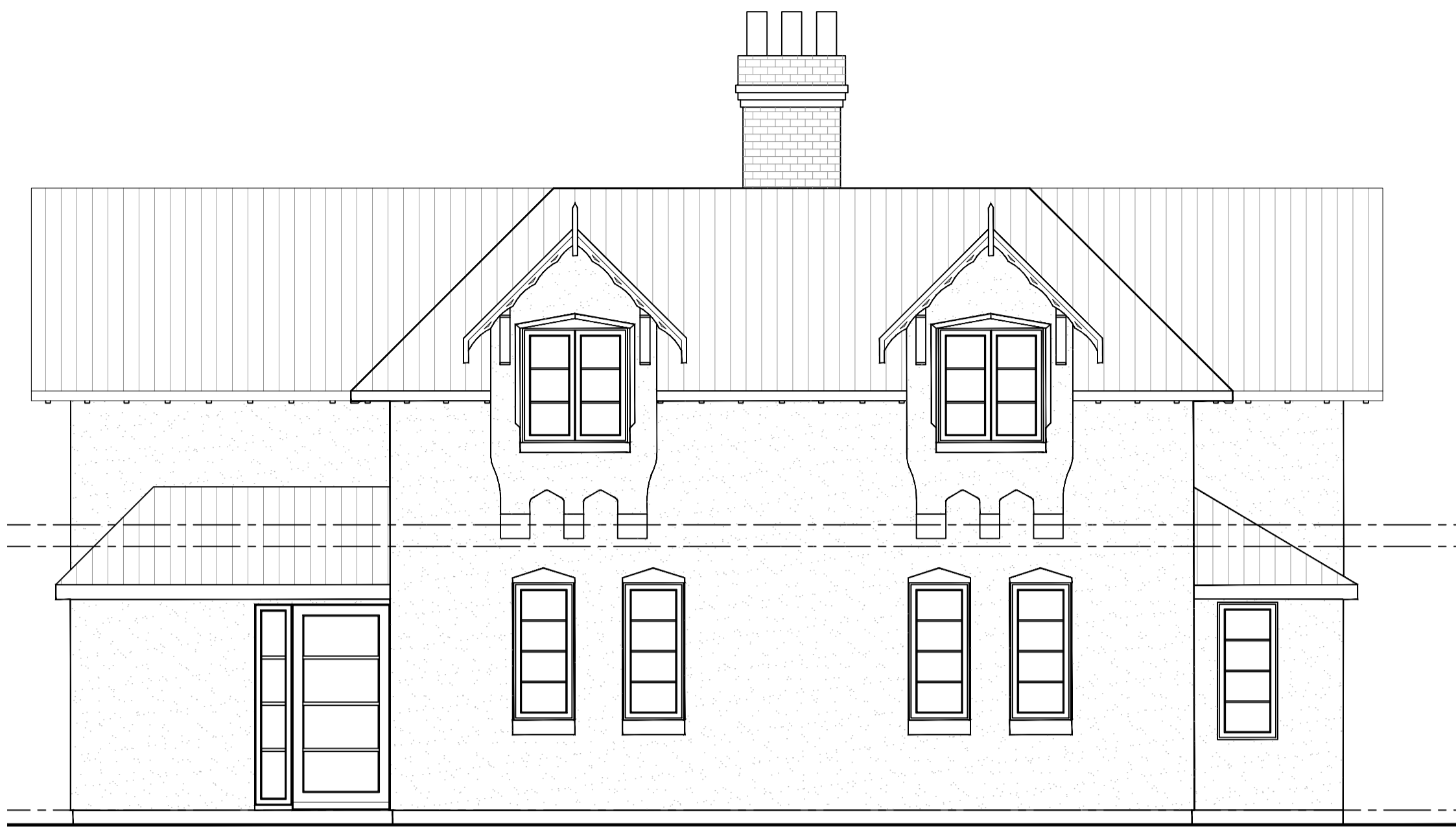
Existing Front Elevation 1:50