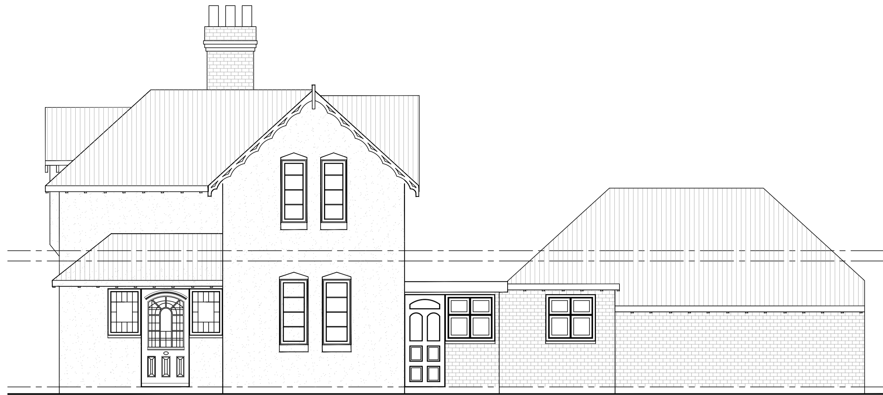
Existing Side Elevation 1 1:50