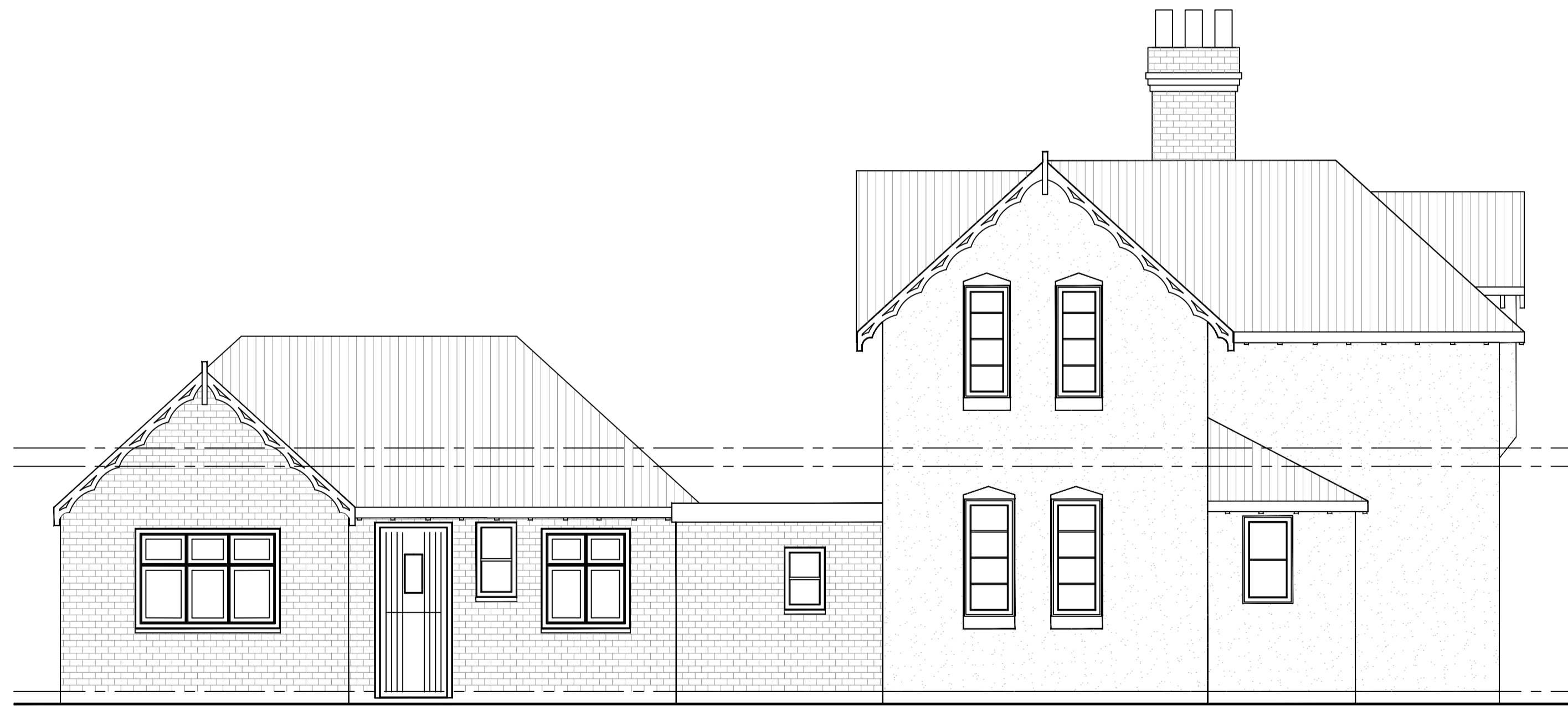
Existing Side Elevation 2 1:50