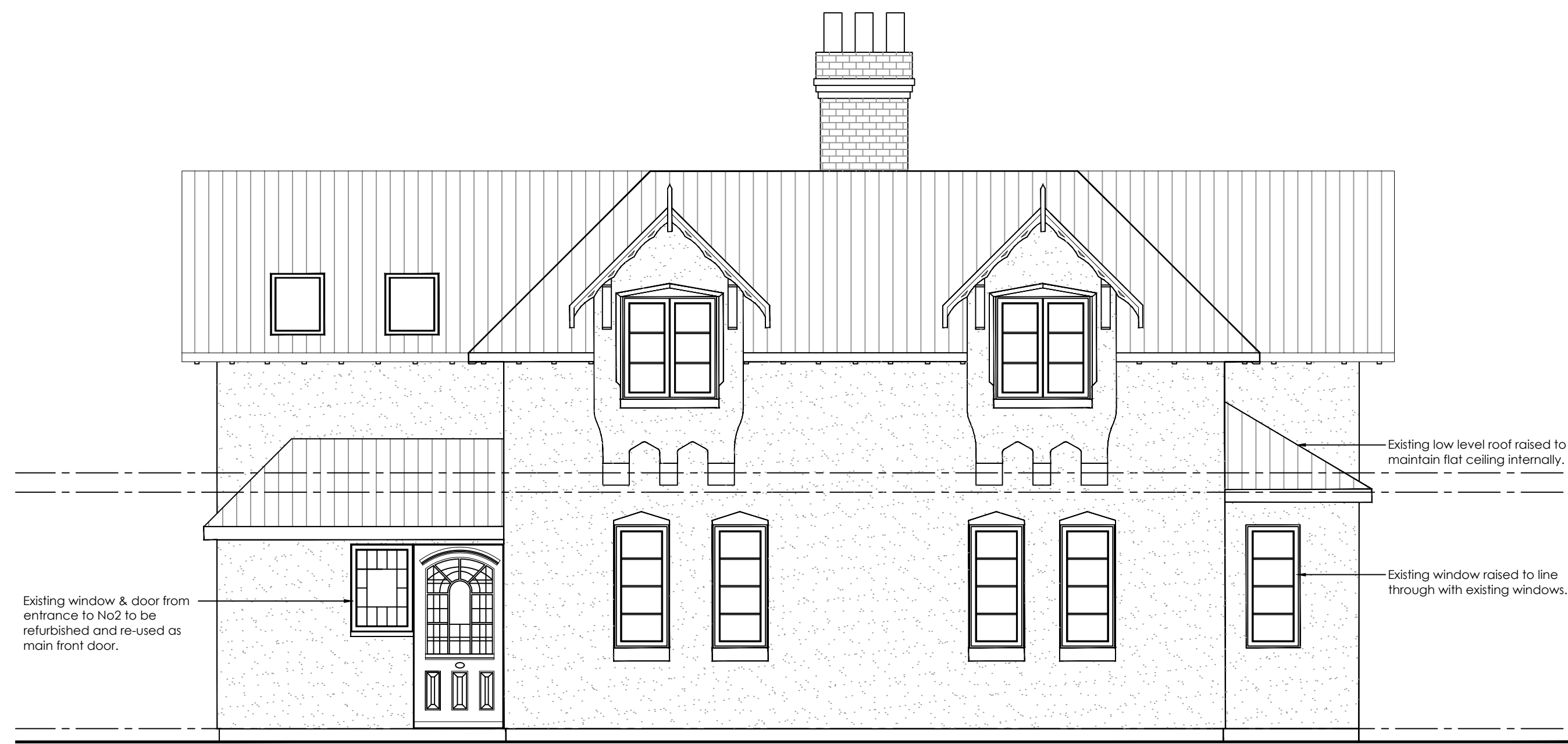
Proposed Front Elevation 1:50