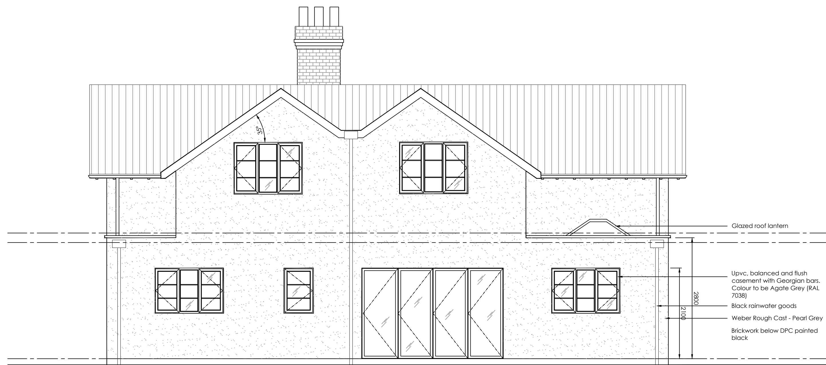
Proposed Rear Elevation 1:50