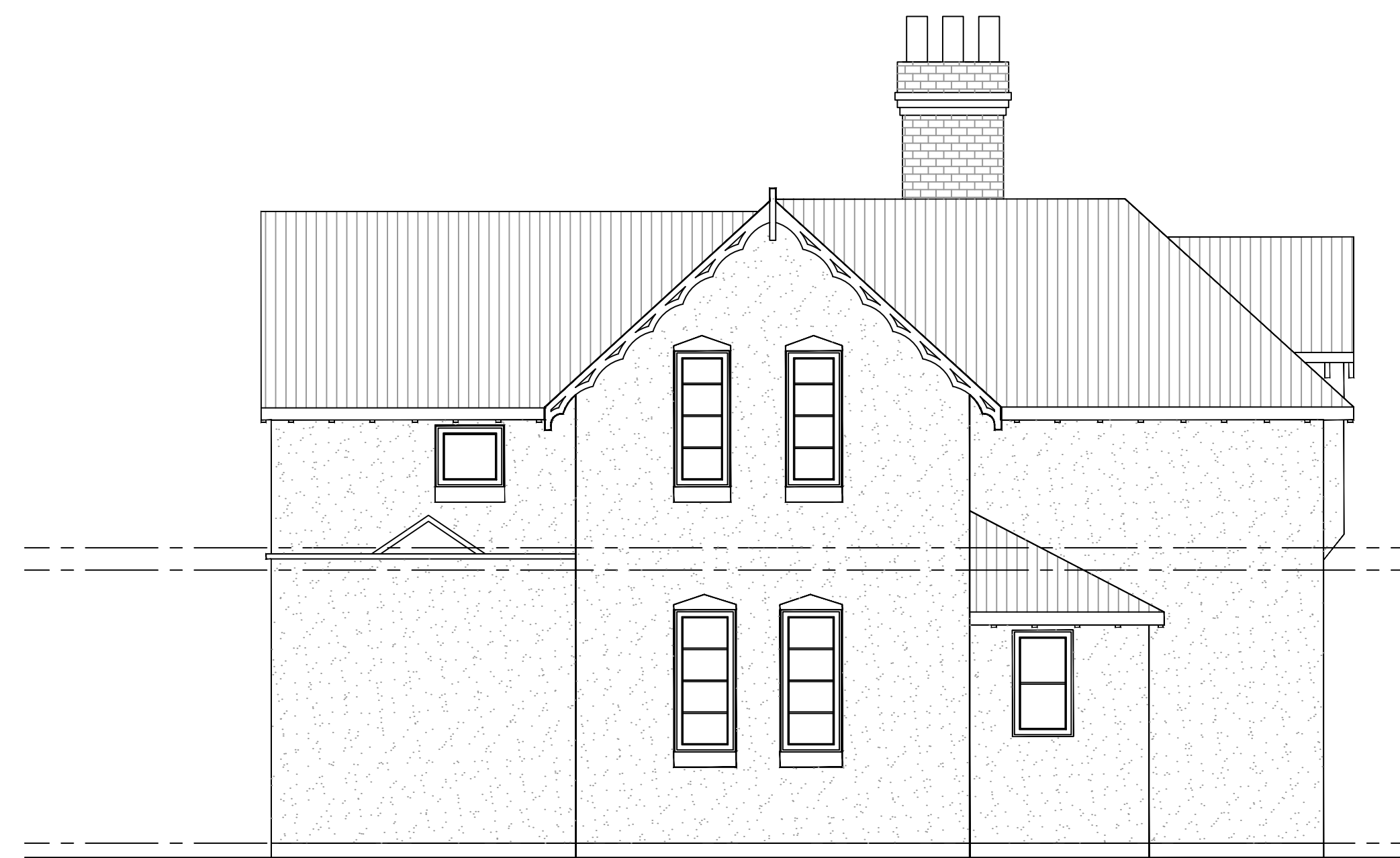
Proposed Side Elevation 2 1:50