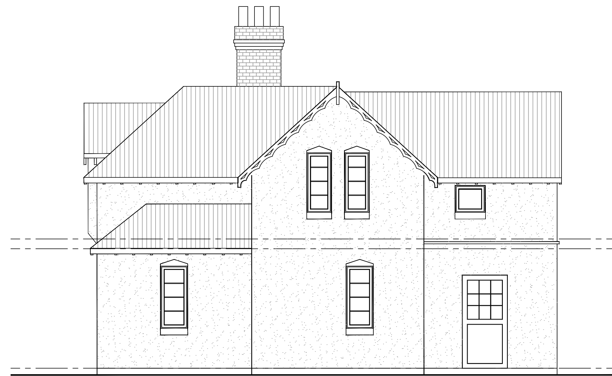
Proposed Side Elevation 1 1:50