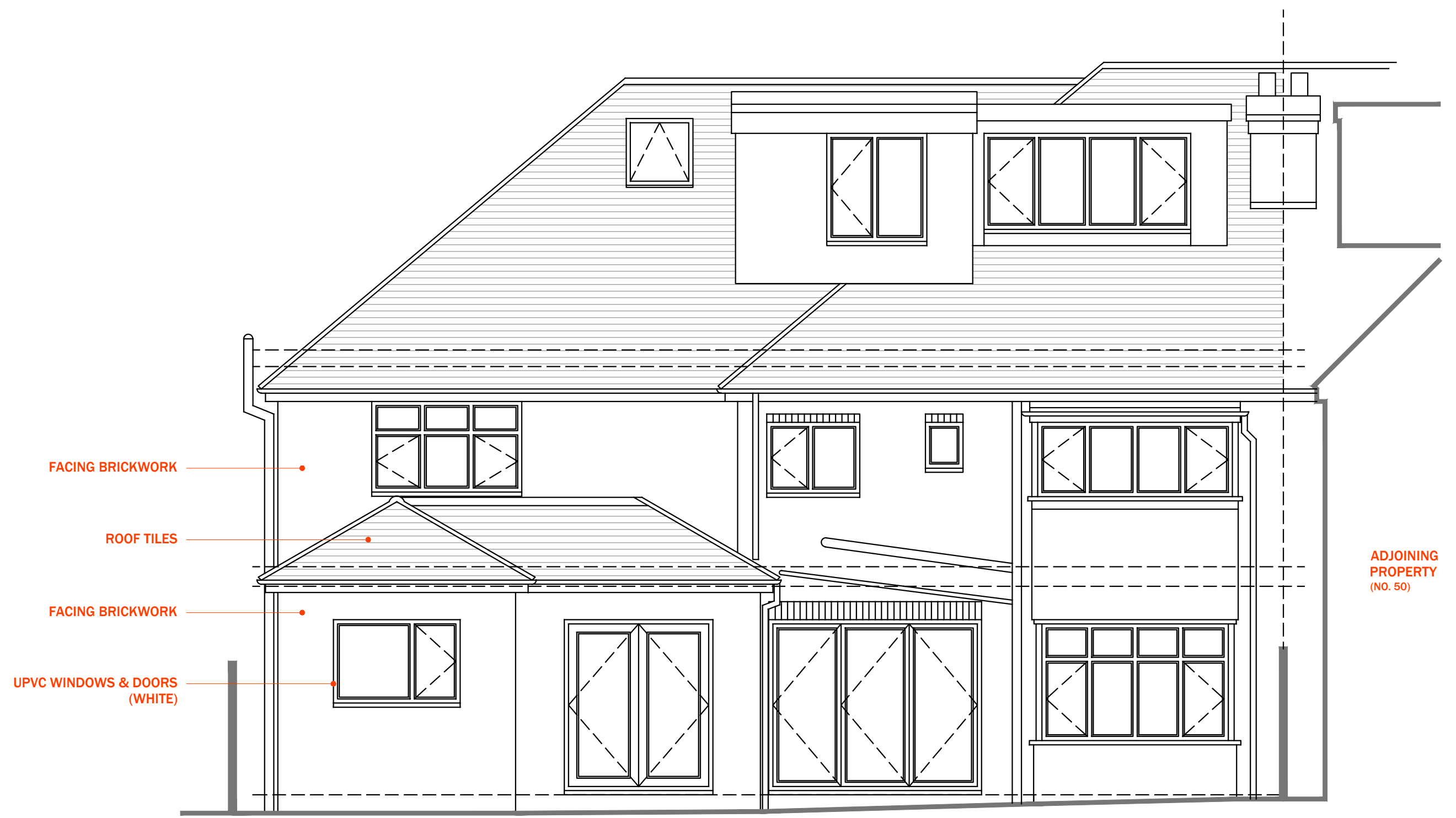
EXISTING REAR ELEVATION 1:50