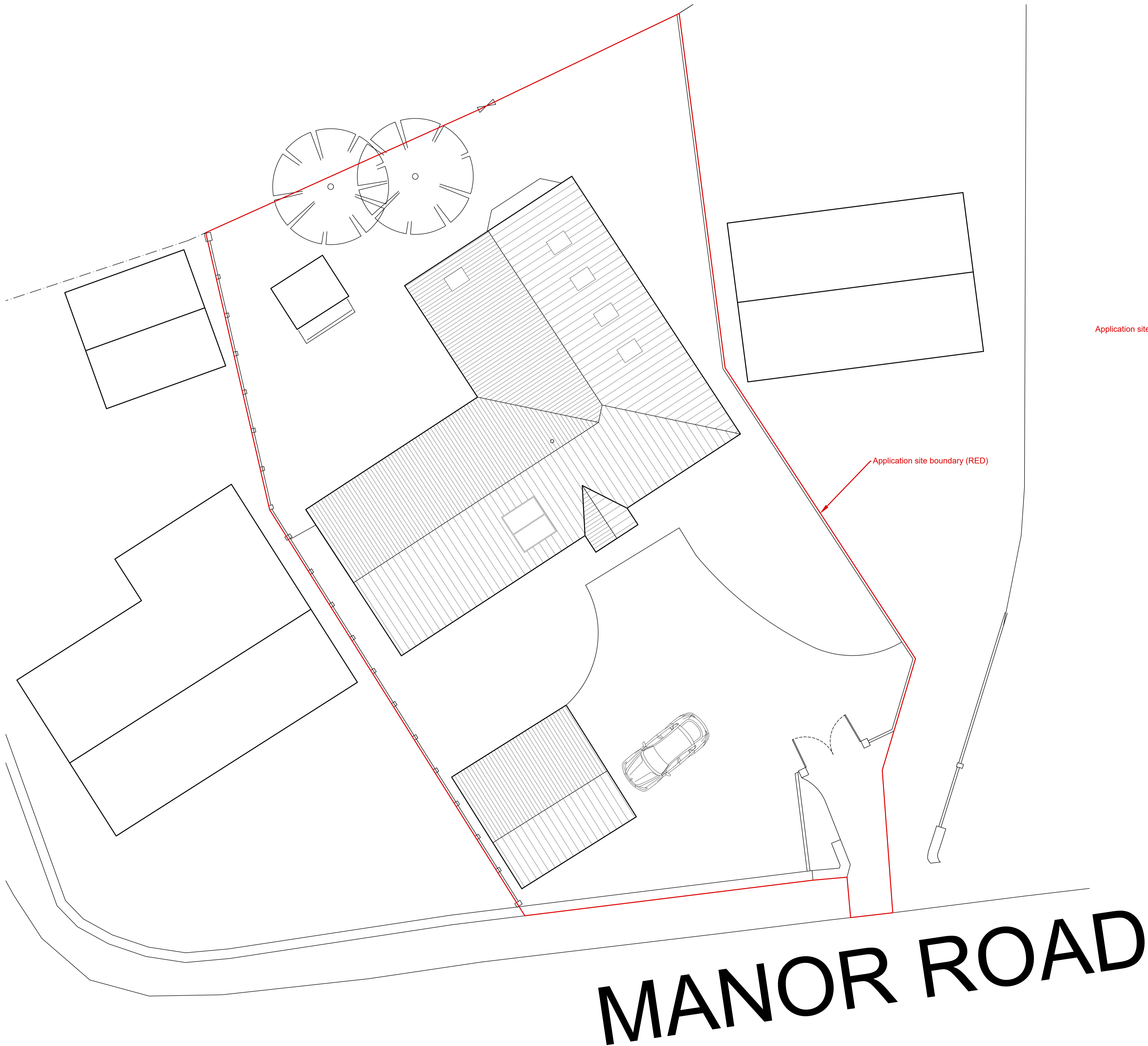
Existing Block Plan Scale - 1:100