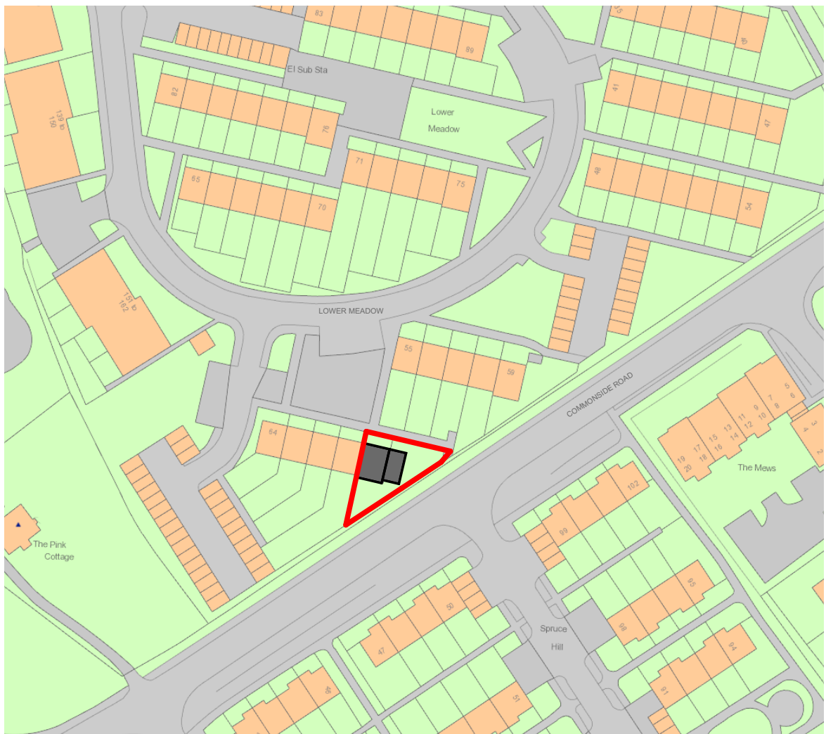
LOCATION MAP 1:1250