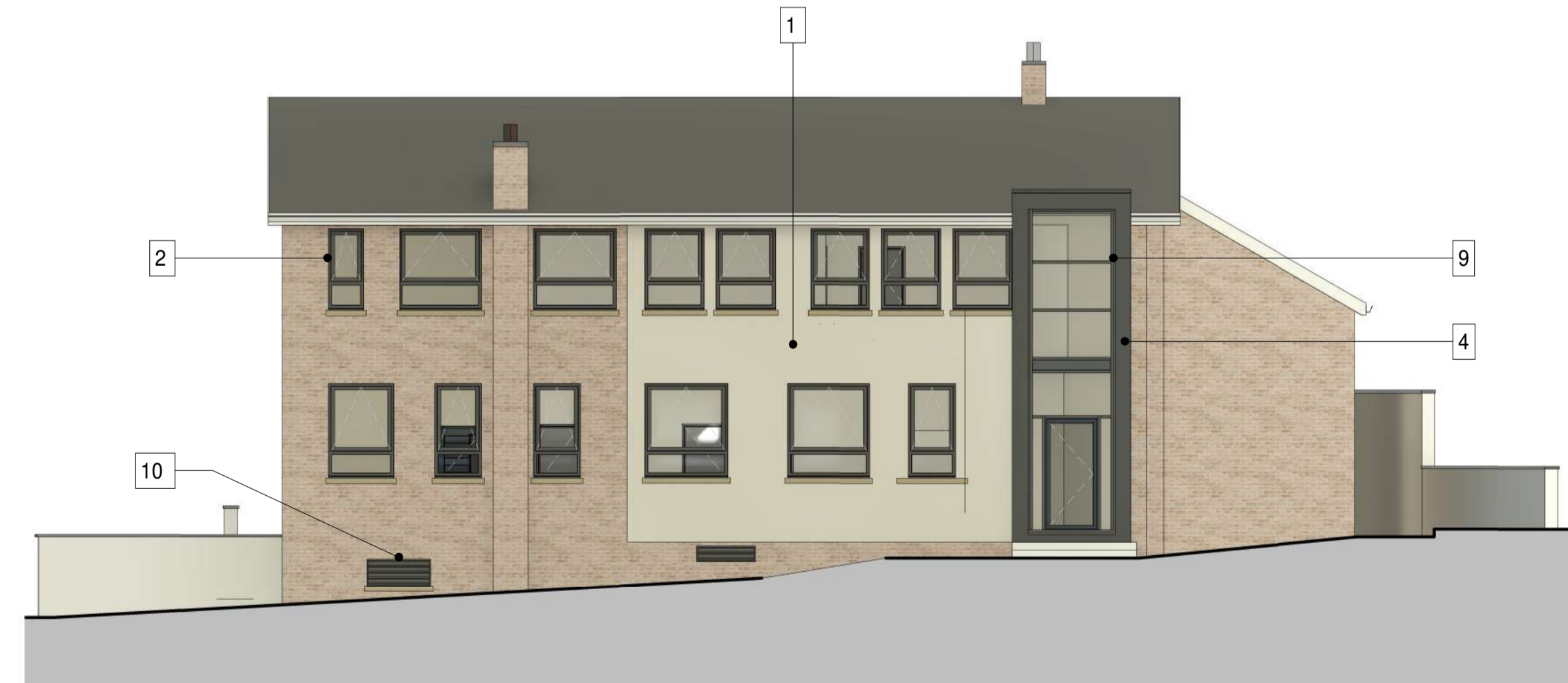
D - Proposed West Elevation