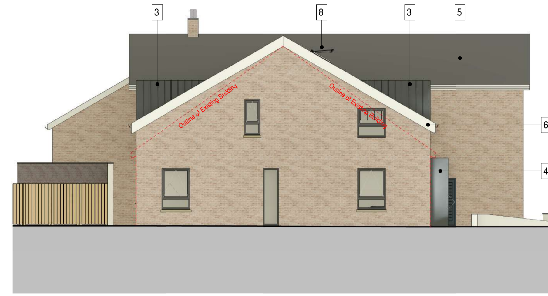
B- Proposed East Elevation