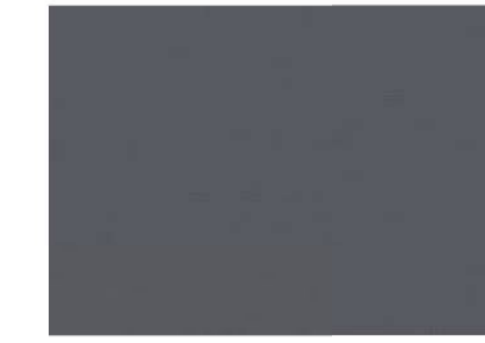
Material - 4

INFORMATION CONTAINED IN THIS DRAWING IS THE SOLE COPYRIGHT OF ORANGE DESIGN STUDIO AND IS NOT TO BE REPRODUCED WITHOUT PERMISSION