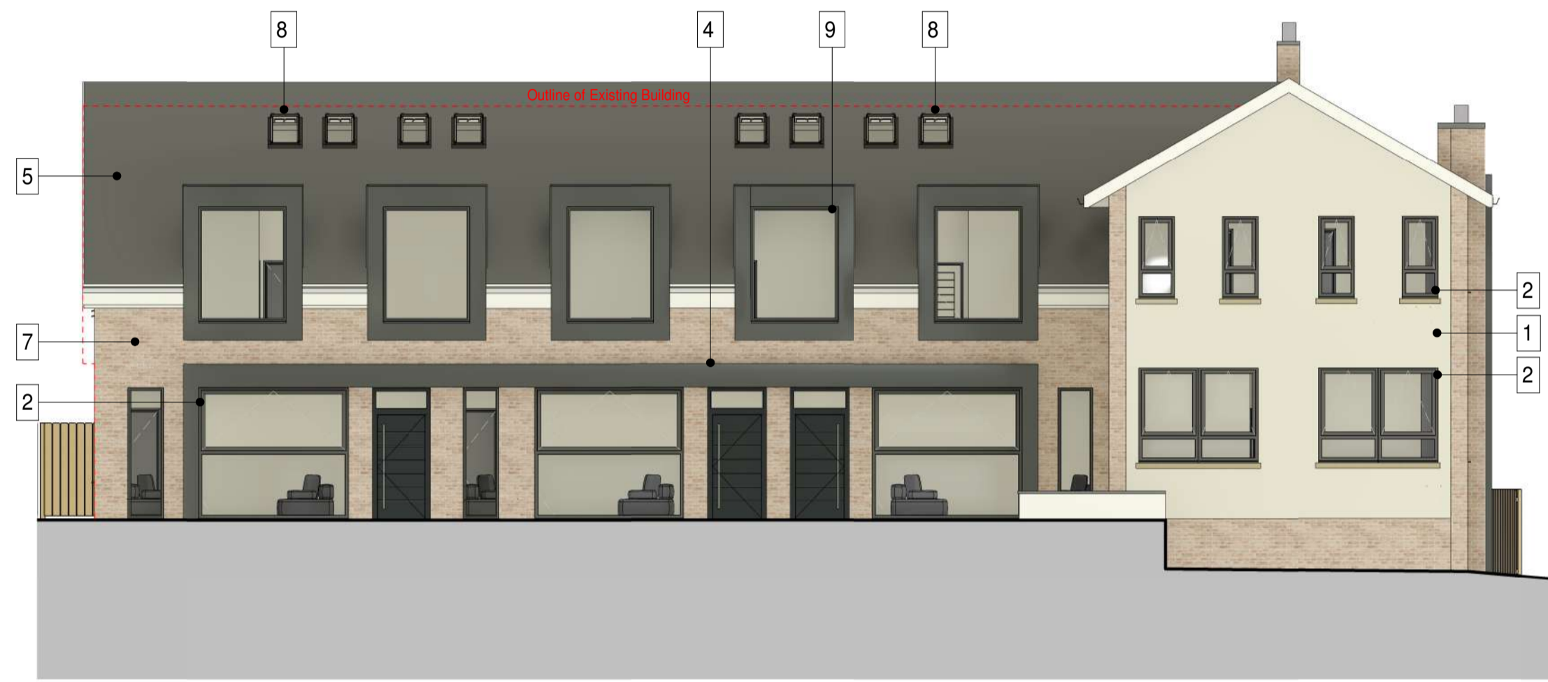
A - Proposed North Elevation