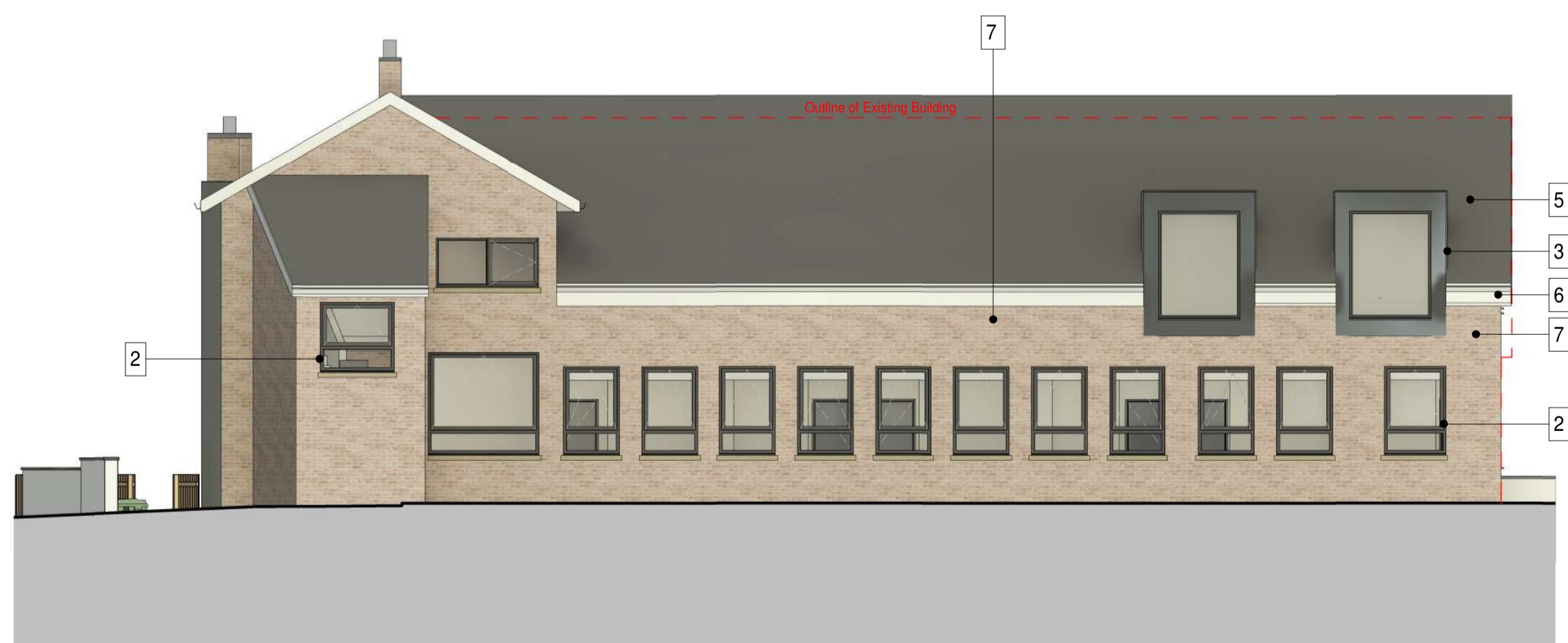
C - Proposed South Elevation