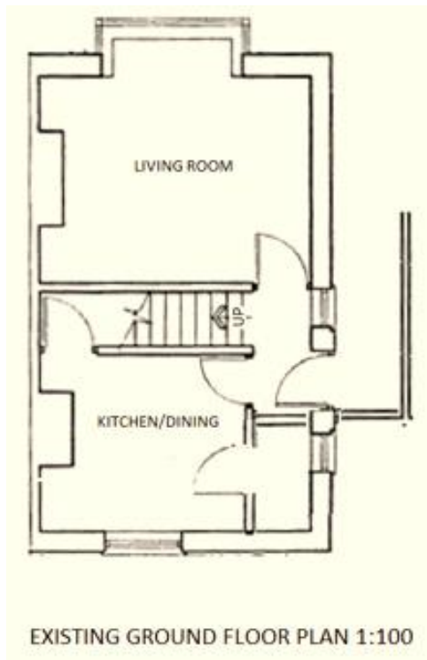
EXISTING GROUND FLOOR PLAN 1:100