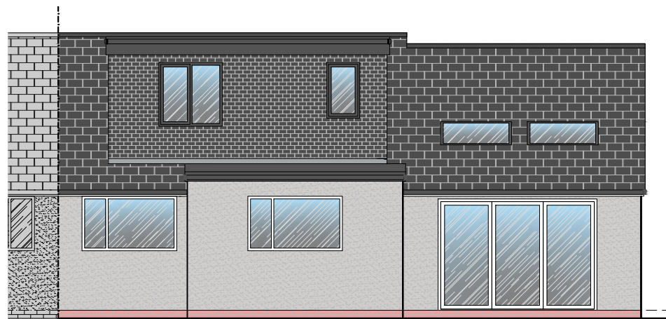
1. Proposed East Elevation Scale 1:100