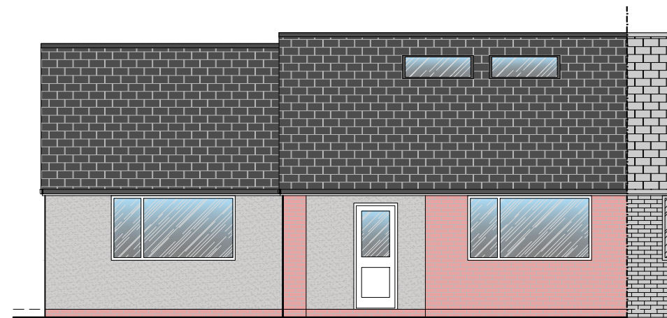
2. Proposed West Elevation Scale 1:100