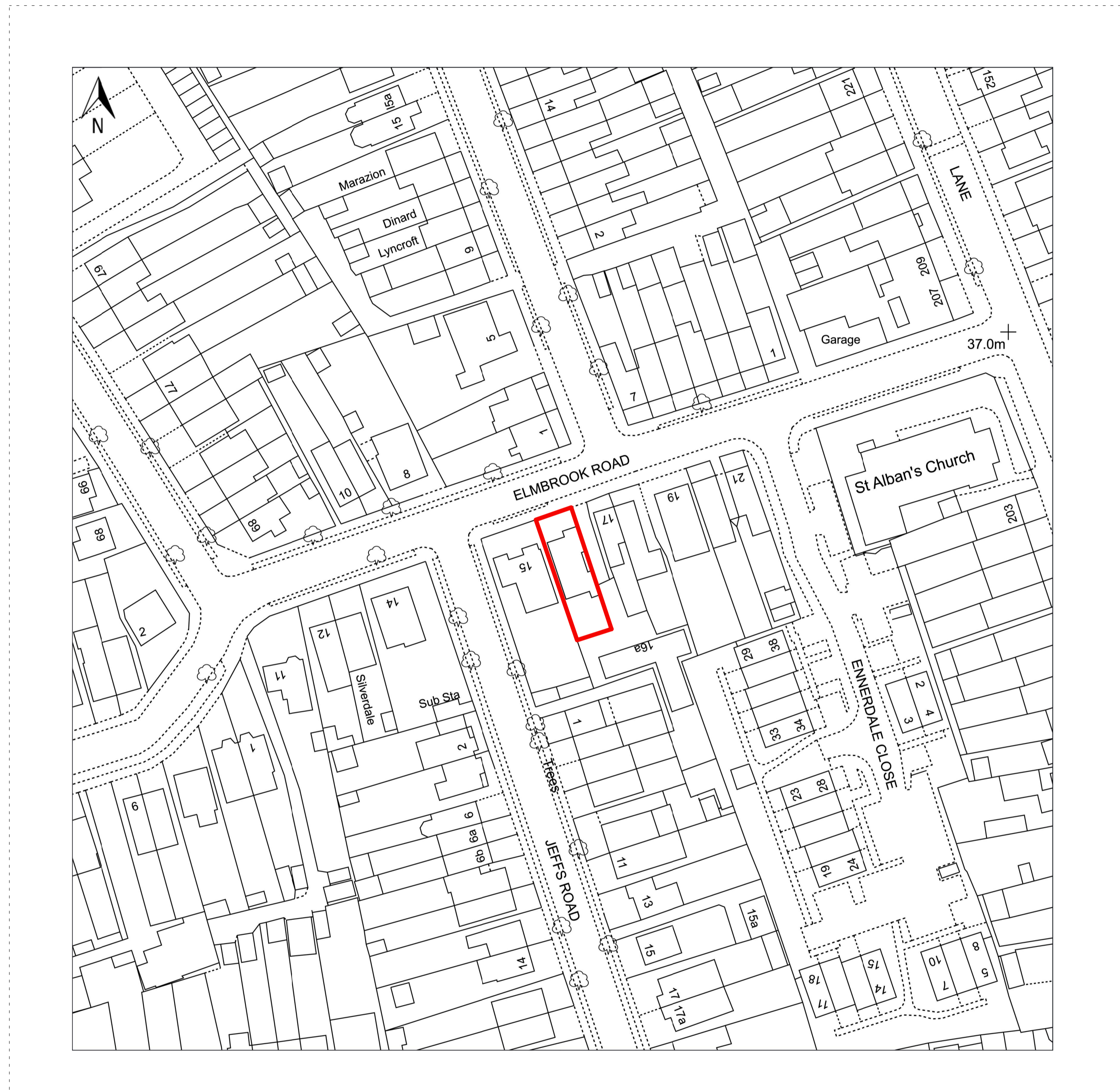
LOCATION PLAN 1:1250@A3

Notes Do not scale from drawing unless for planning purposes. All dimensions to be checked on site. All levels to be checked on site. All setting out must be checked on site. This drawing is copyright Whiteman Architects Ltd. This drawing must not be used onsite unless 'Issued for Construction'.