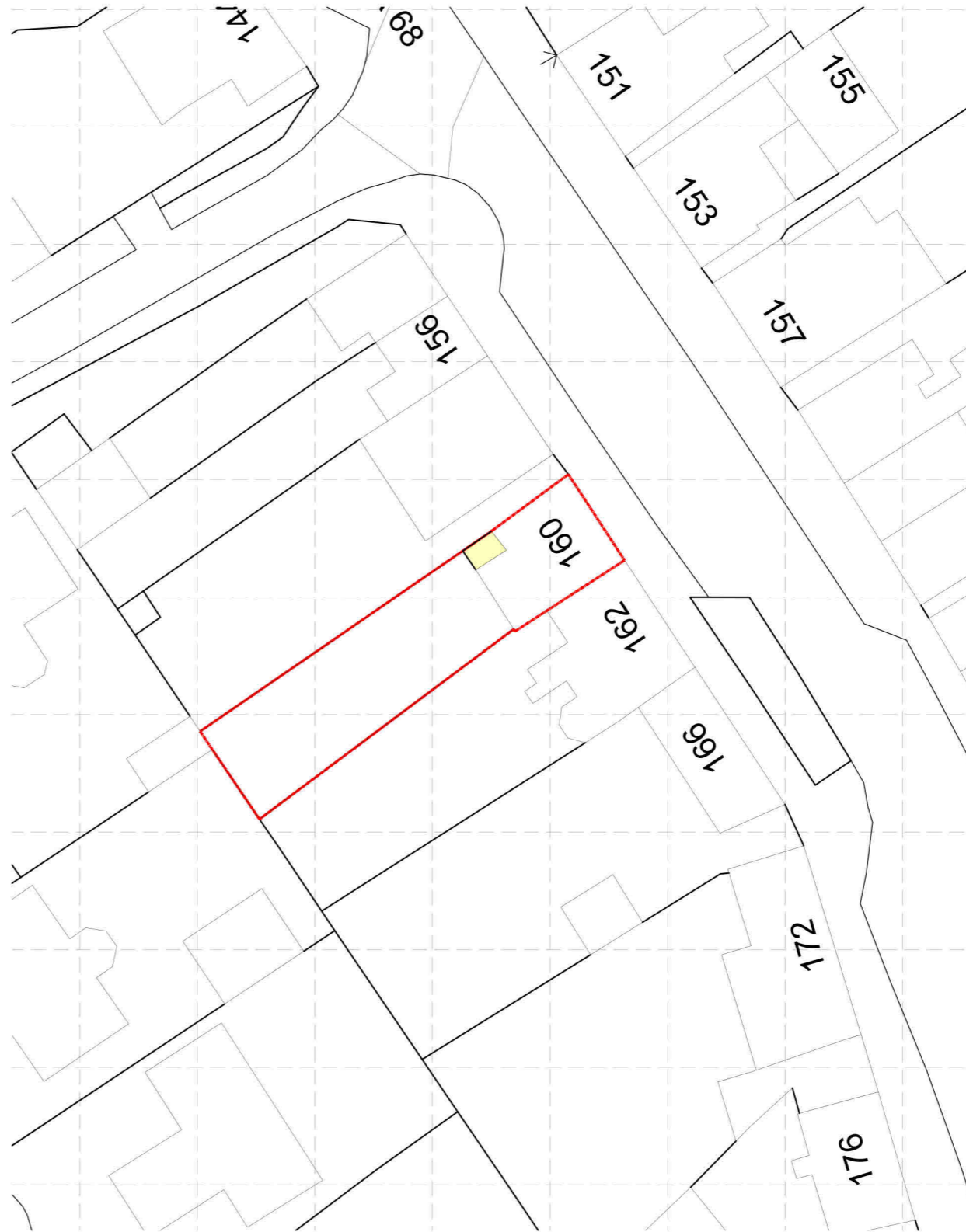
PROPOSED | SITE LOCATION 1:500

This copy has been made by or with the authority of Midlothian Council pursuant to Section 47 of the Designs and Patents Act 1988. Unless that Act provides a relevant exception to copyright, the copy must not be copied without the prior permission of the copyright owner.