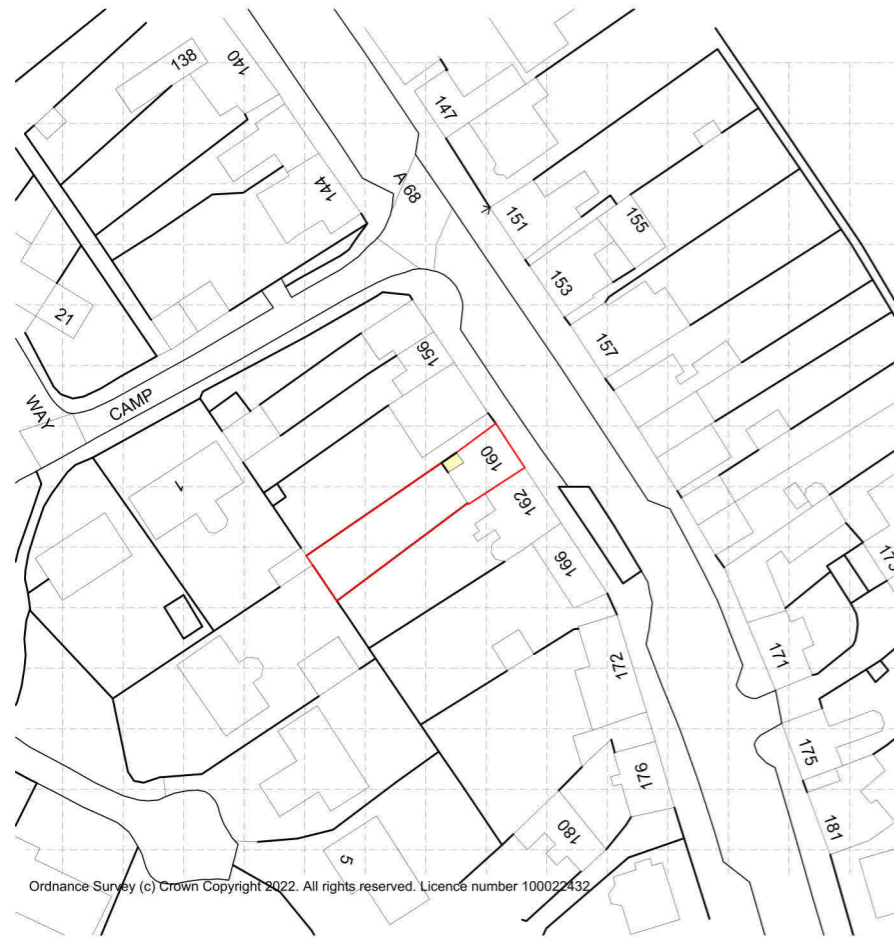
PROPOSED | LOCATION PLAN 1:1250