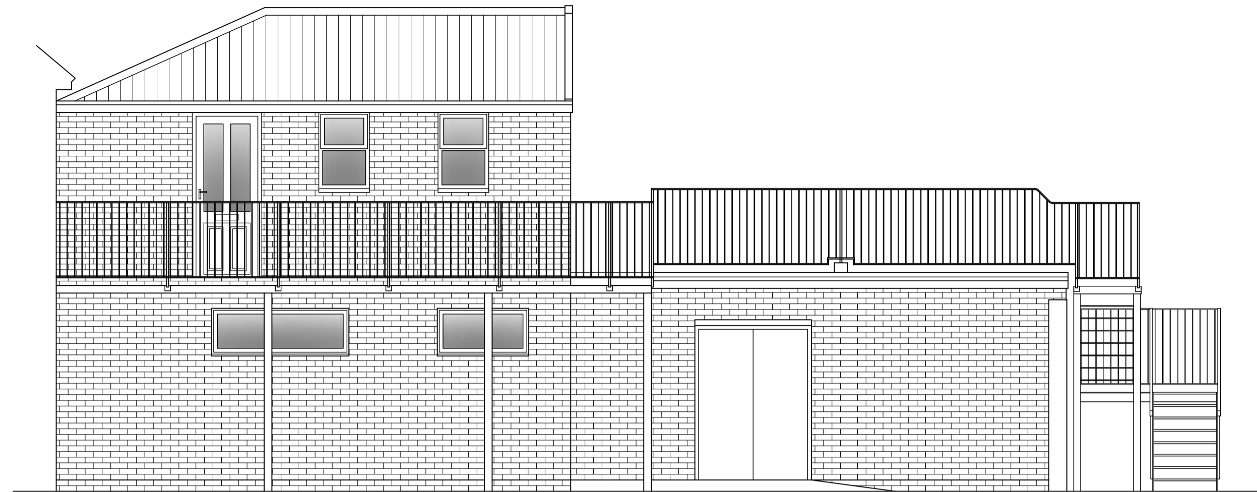
Existing Partial Right Flank Elevation (1:50)