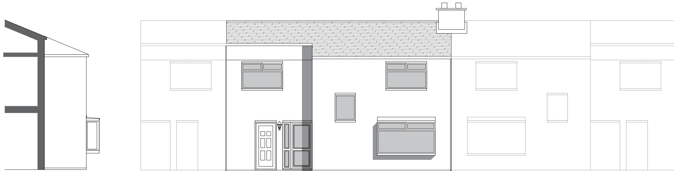
SIDE ELEVATION AS EXISTING SCALE 1:100 (AT A3)