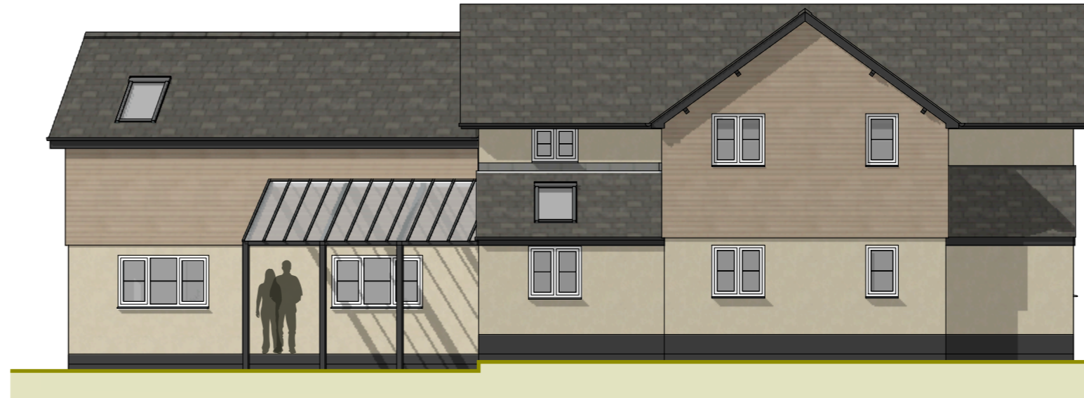
North East Elevation. Scale 1:100