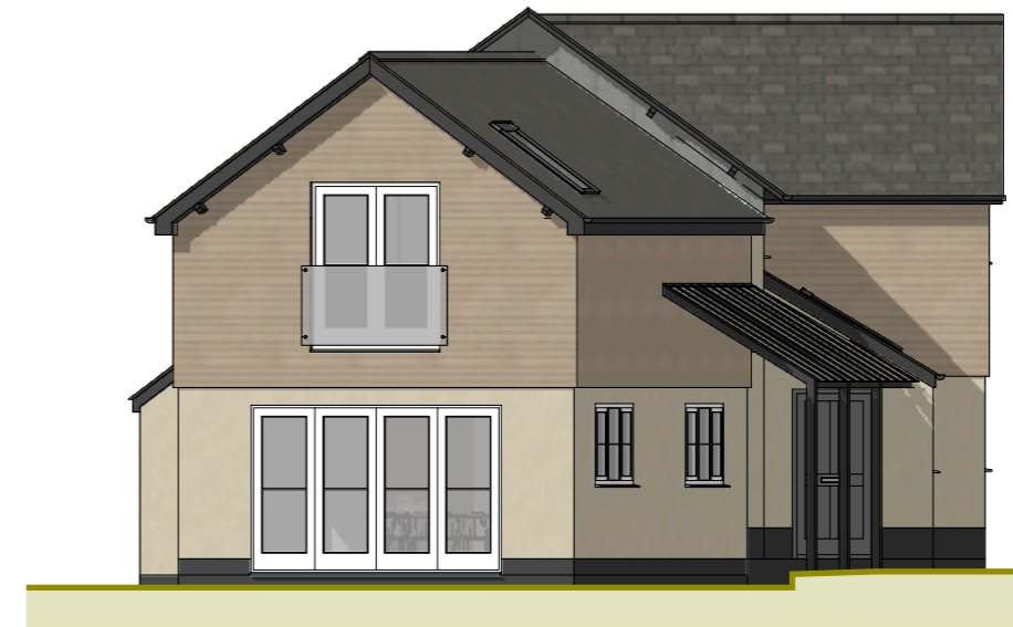
South East Elevation. Scale 1:100