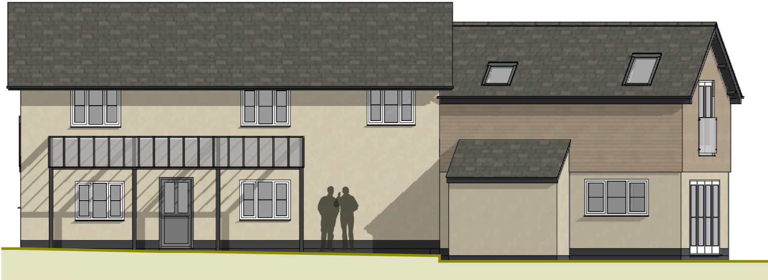
South West Elevation. Scale 1:100

COPYRIGHT: ALL RIGHTS RESERVED. DESIGN AND CONTENT CONTAINED IN THIS DOCUMENT MUST NOT BE REPRODUCED WITHOUT PERMISSION.