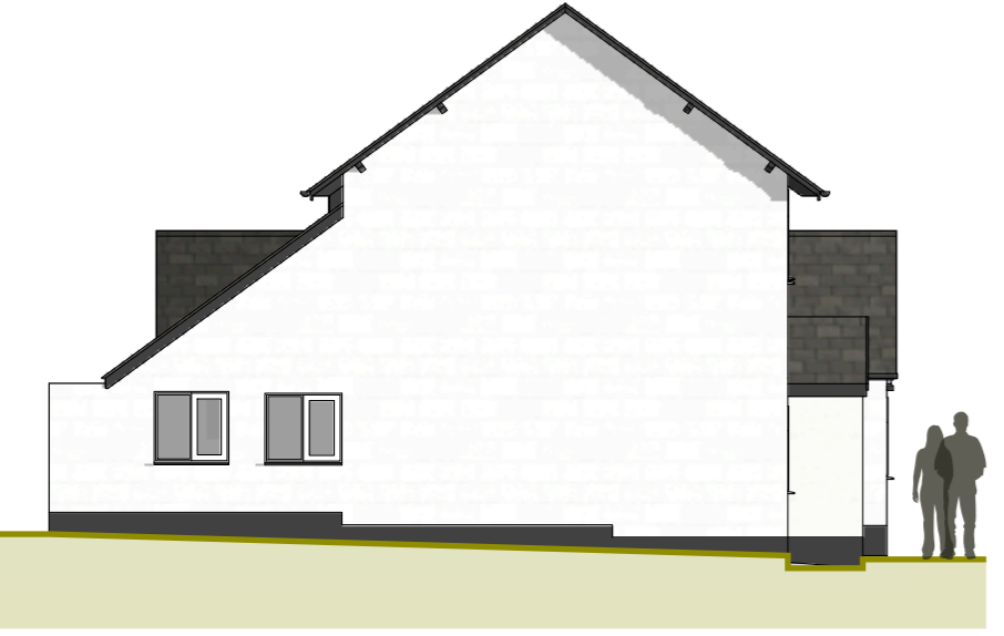
North West Elevation. Scale 1:100