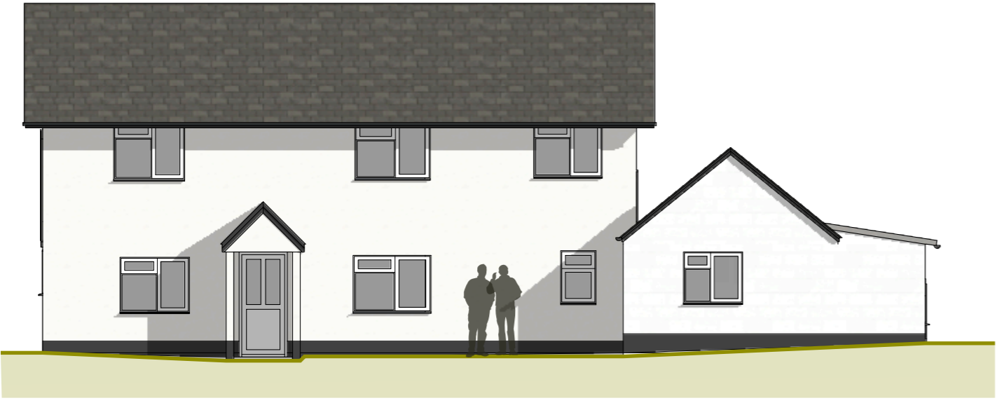
South West Elevation. Scale 1:100

COPYRIGHT: ALL RIGHTS RESERVED. DESIGN AND CONTENT CONTAINED IN THIS DOCUMENT MUST NOT BE REPRODUCED WITHOUT PERMISSION.