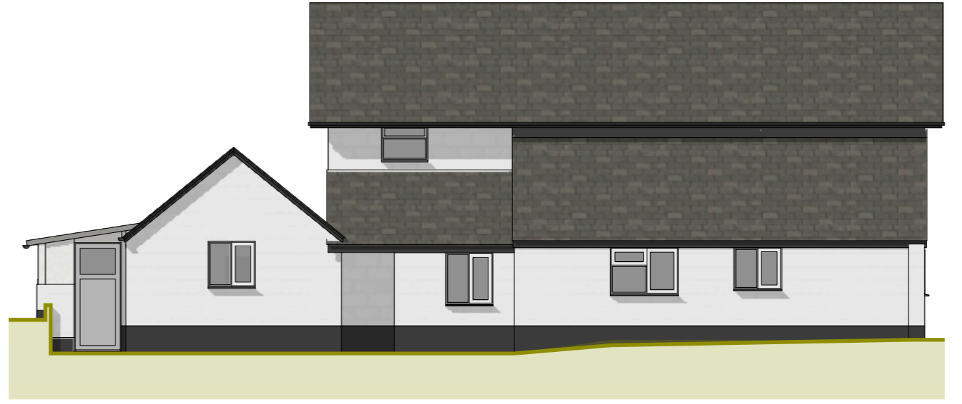
North East Elevation. Scale 1:100