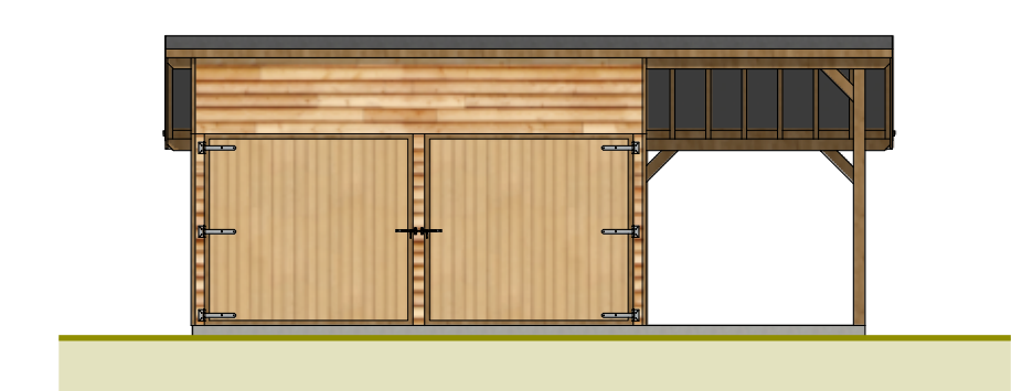
North West Elevation. Scale 1:100