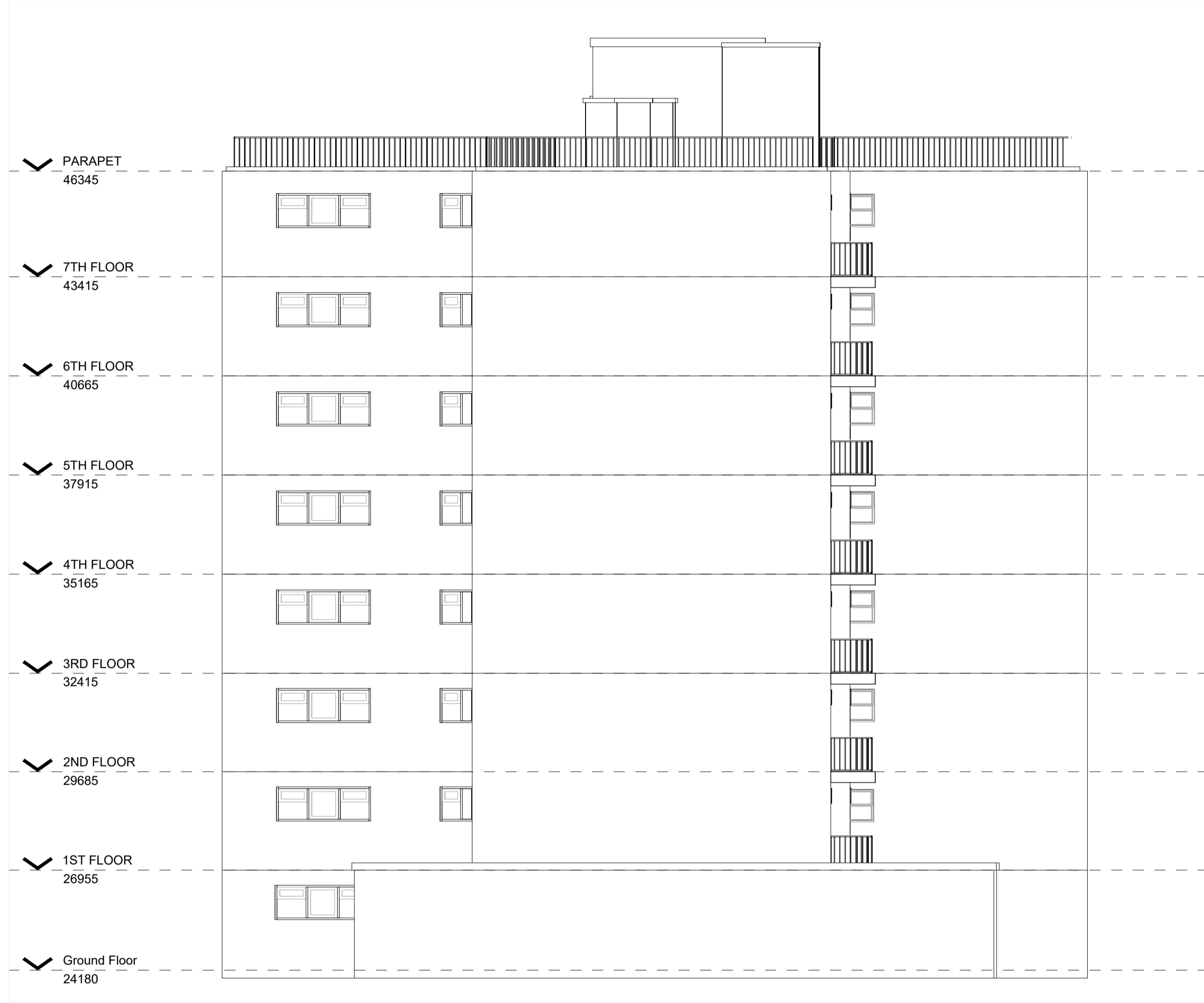
Elevation 3 1 : 100