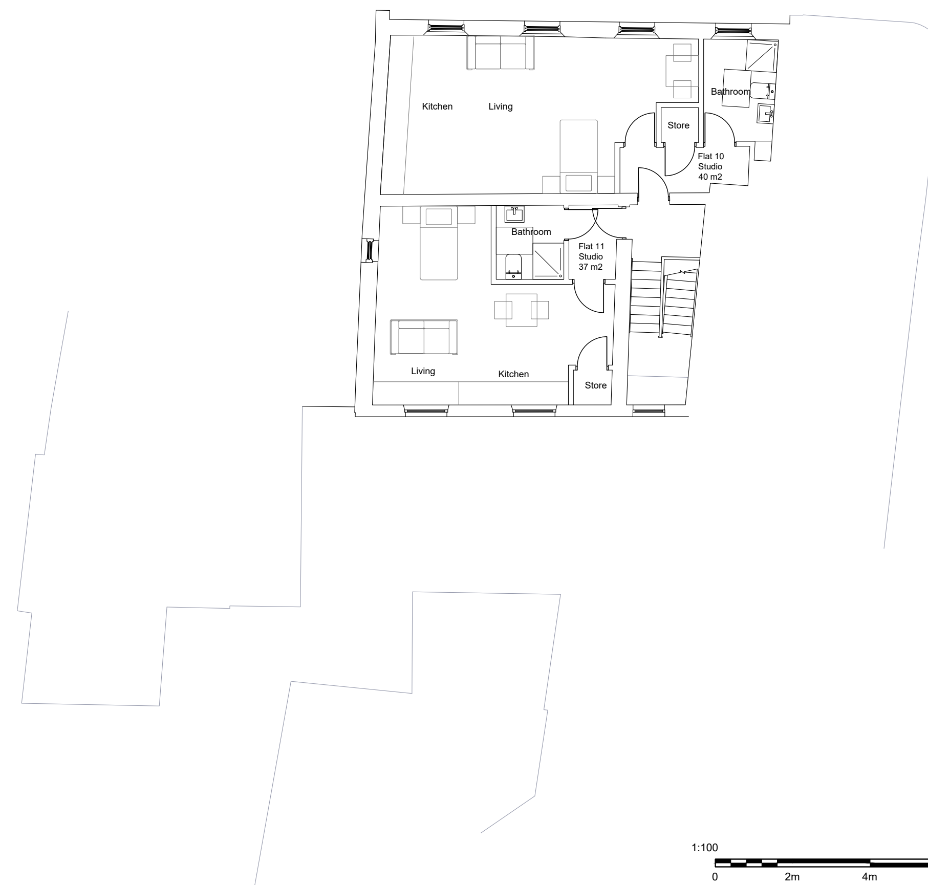
Proposed Second Floor Plan