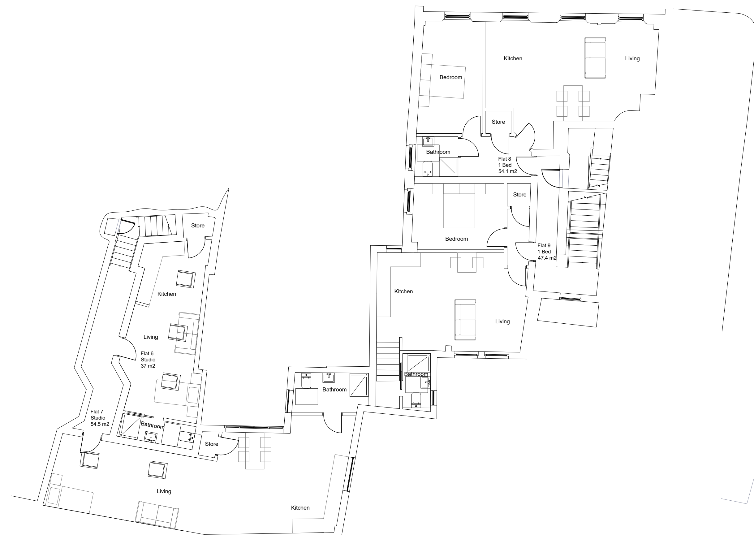
Proposed First Floor Plan