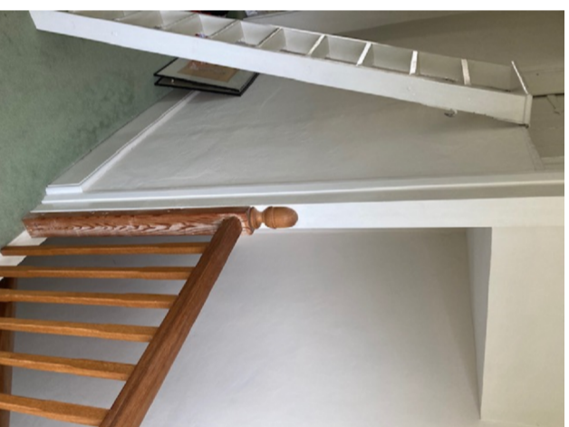
View of existing loft ladder, balustrade and supporting loft wall