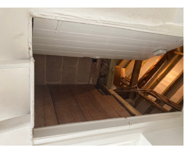
View of top of loft ladder and loft access door