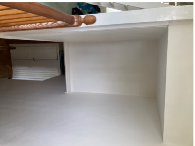
View of back wall of first floor cupboard beyond