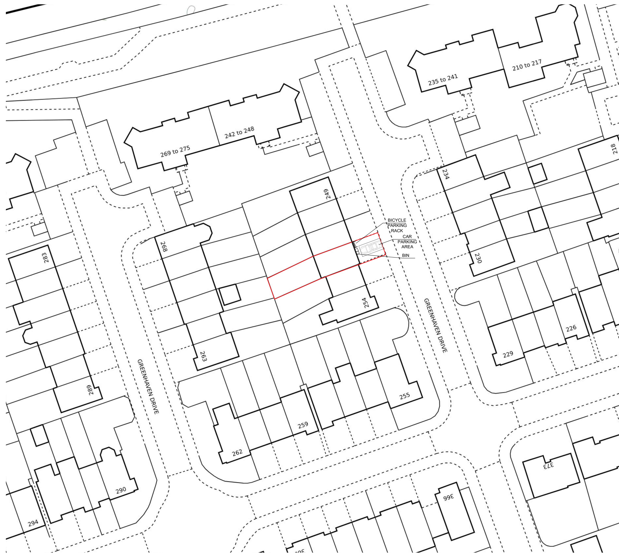
Proposed Block Plan

Any dimensions shown should be checked on site and discrepancies reported to the Architect prior to construction. Designs are not coordinated with engineer projects. Do not scale for construction purposes.